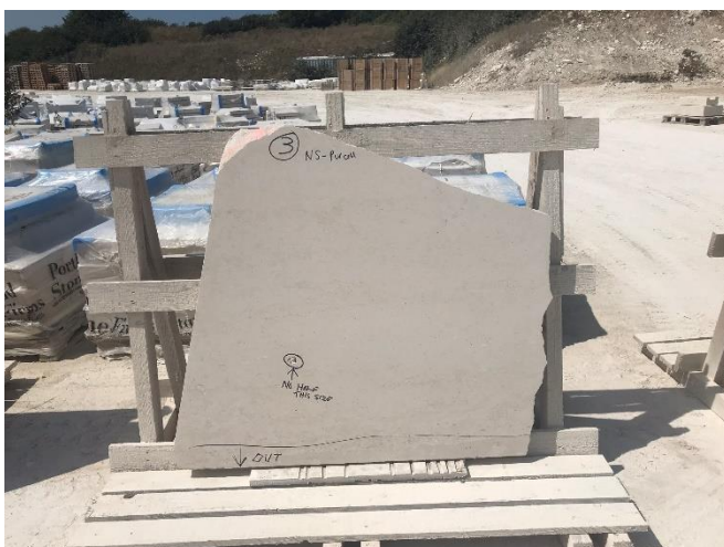
Larger format samples of the selected Portland Broadcroft Whitbed – reviewed during quarry visit