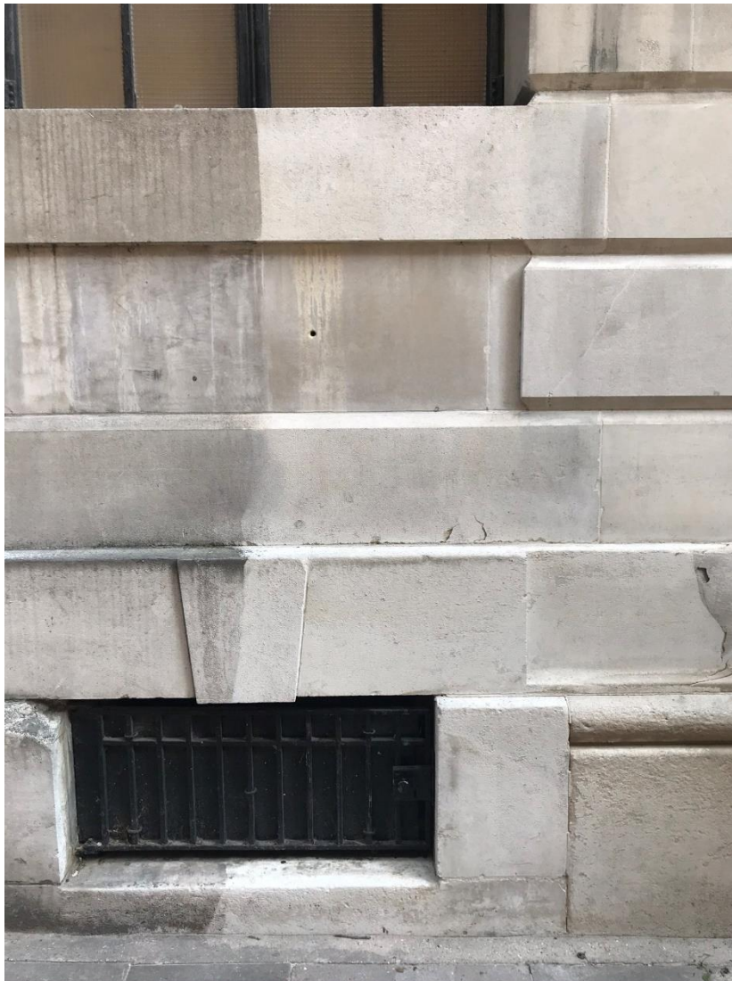
Image of the Doff water-based cleaning sample

Please note that the colour differentiation in the Torc sample image is due to the stone still drying out at the time the photo was taken.