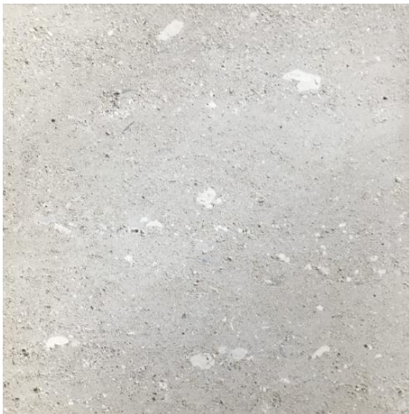
Portland Jordans Whitbed Natural Stone – rejected

CH requested to see the other Portland Stone samples reviewed to support to rationale of selected Portland Stone.