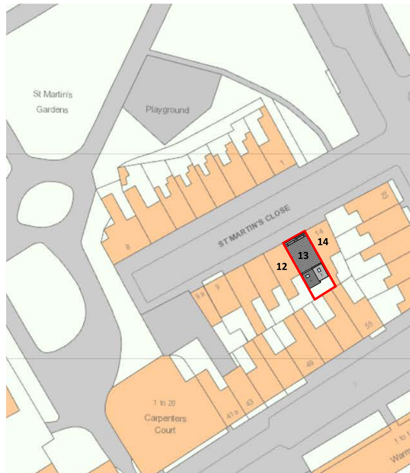
PROPOSED BLOCK PLAN scale 1:500

"This drawing is prepared solely for design and planning submission purposes. It is not intended or suitable for either Building Regulations or Construction purposes and should not be used for such"