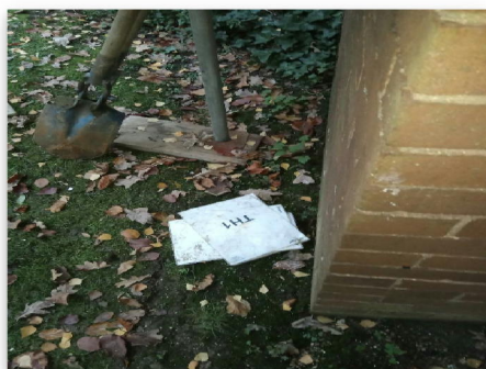
Fig 1.1: Trial Hole 1 Location