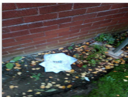
Fig 2.1: Trial Hole 2 Location