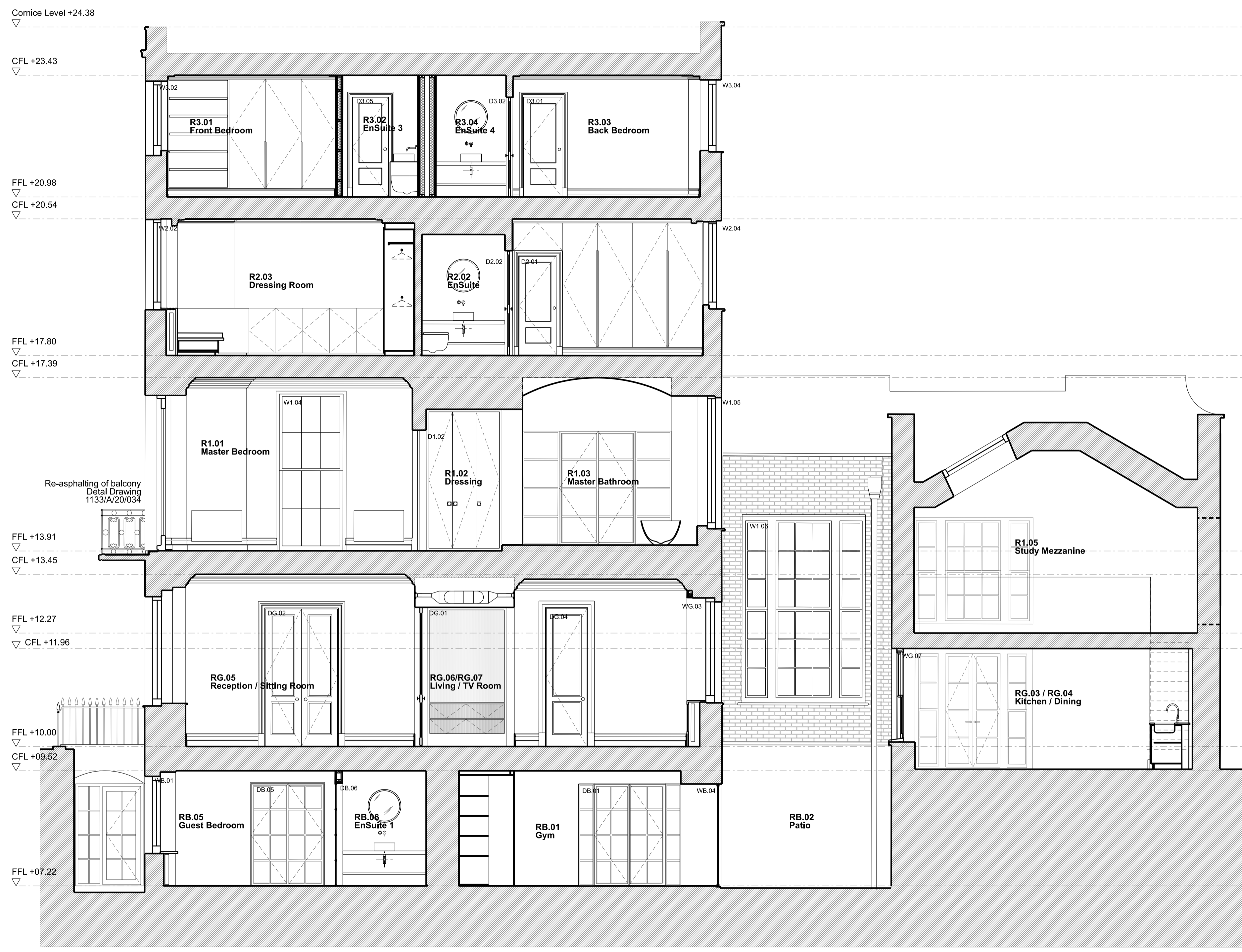
PROPOSED SECTION A