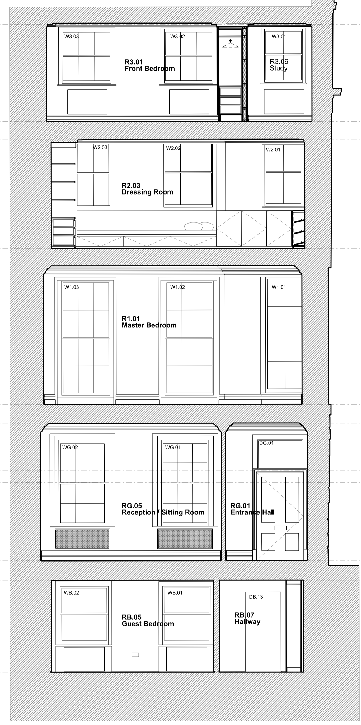
PROPOSED SECTION B