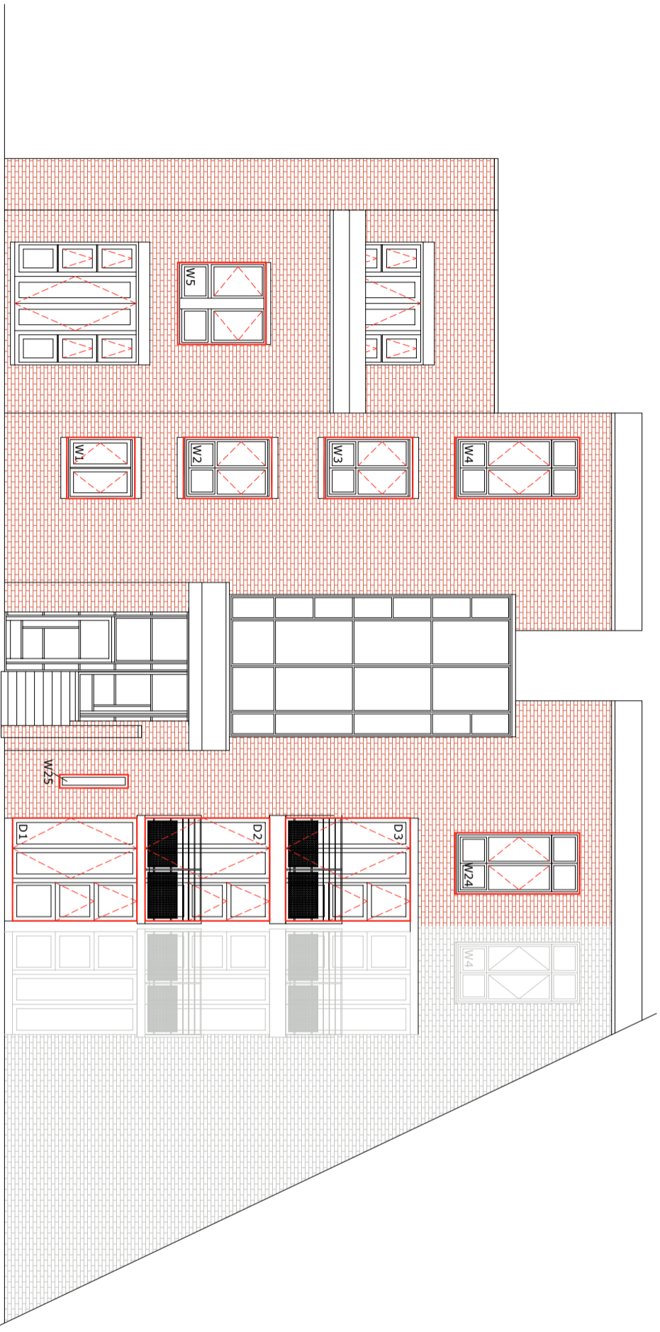
Proposed South Elevation