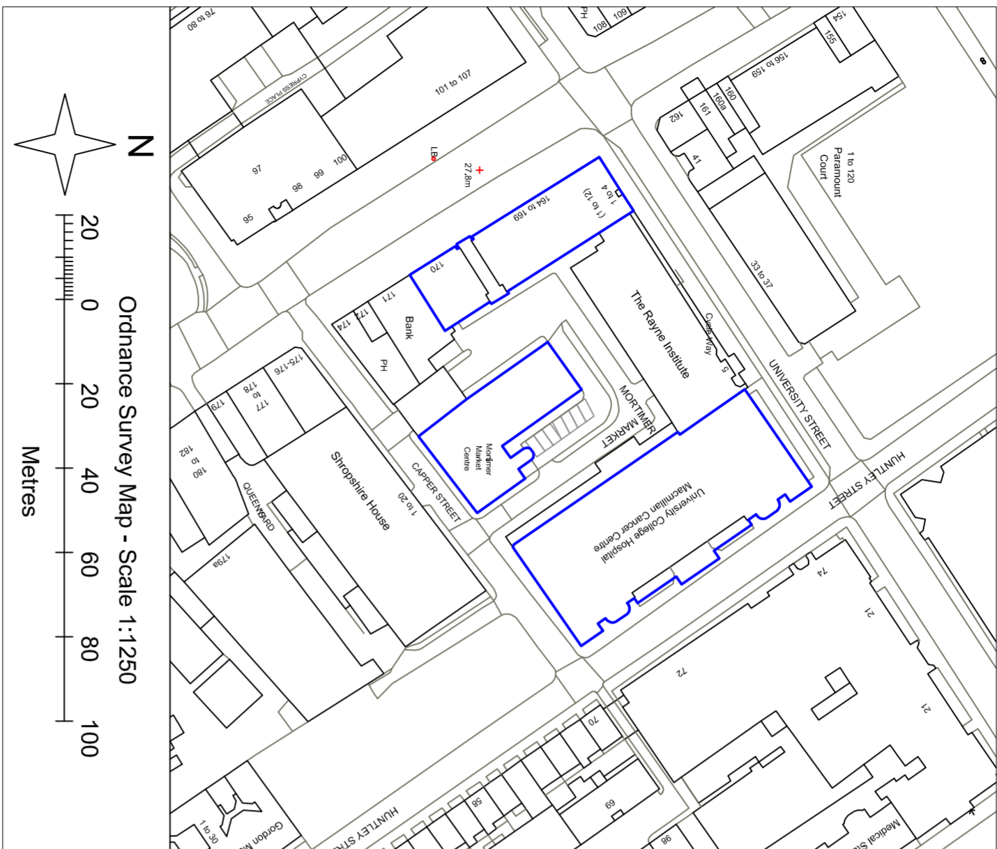
(c) Crown copyright and database rights 2019 OS Licence 10003409