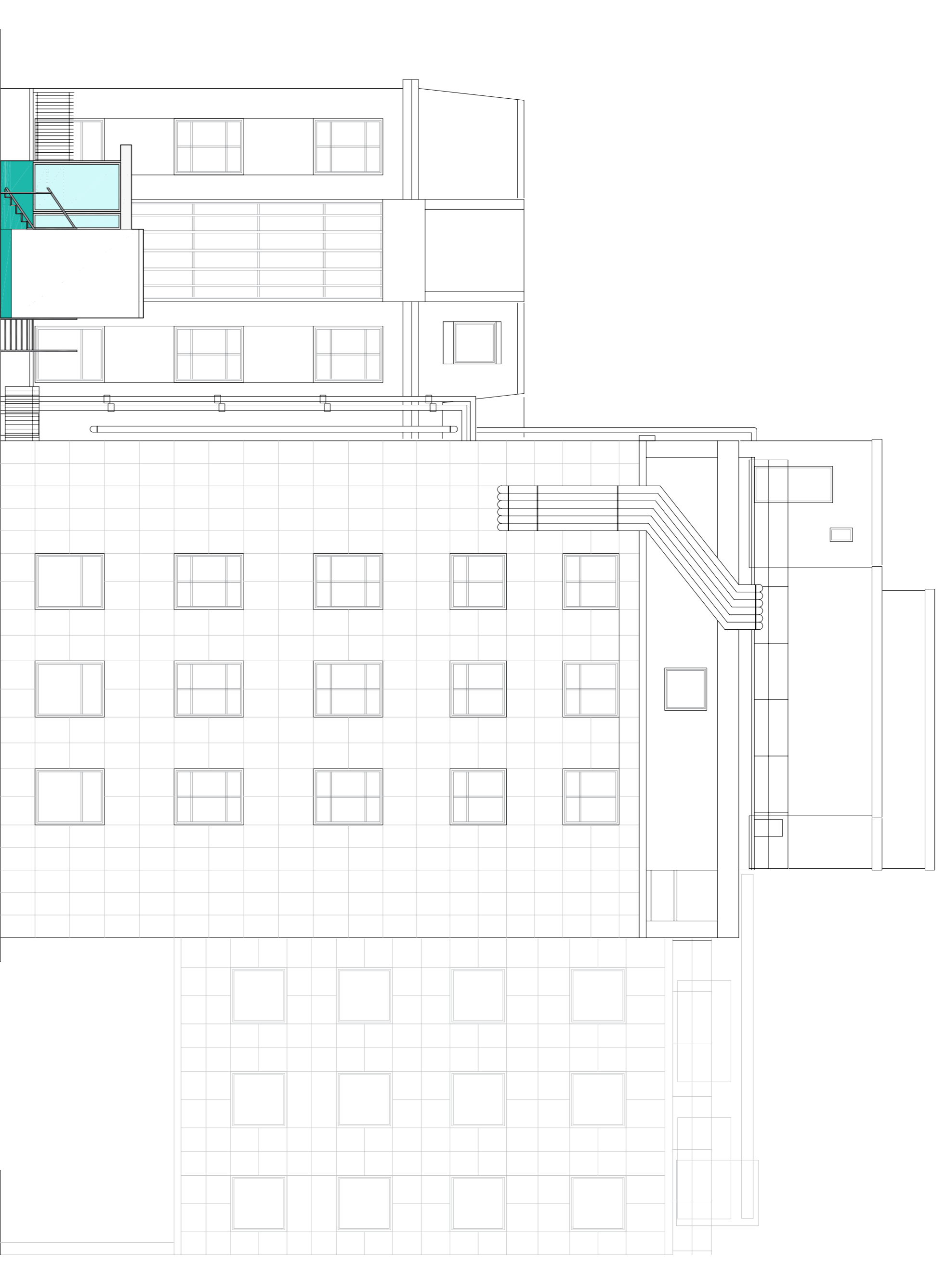
Proposed North West Elevation 1:100