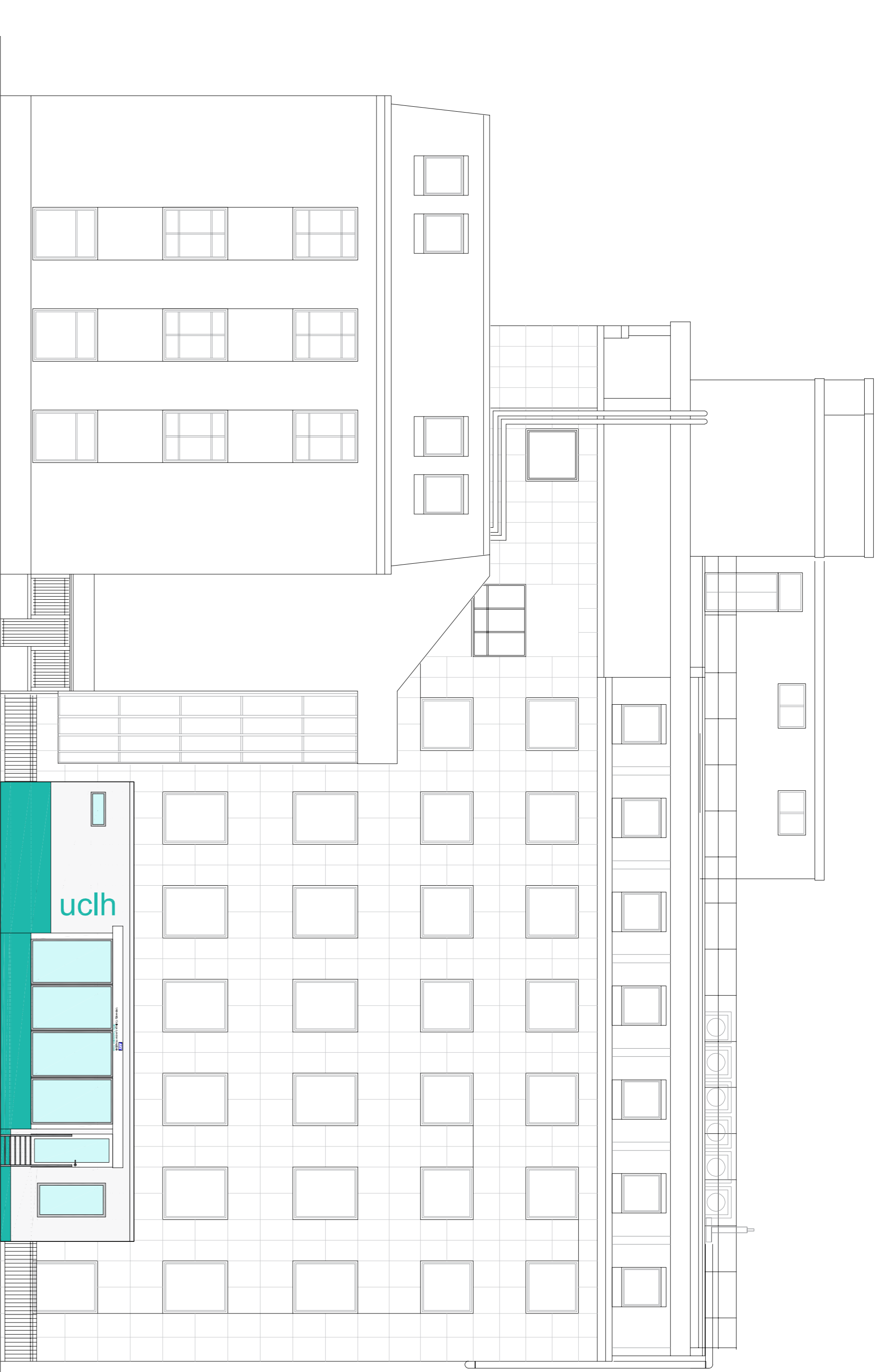
Proposed North East Elevation 1:100