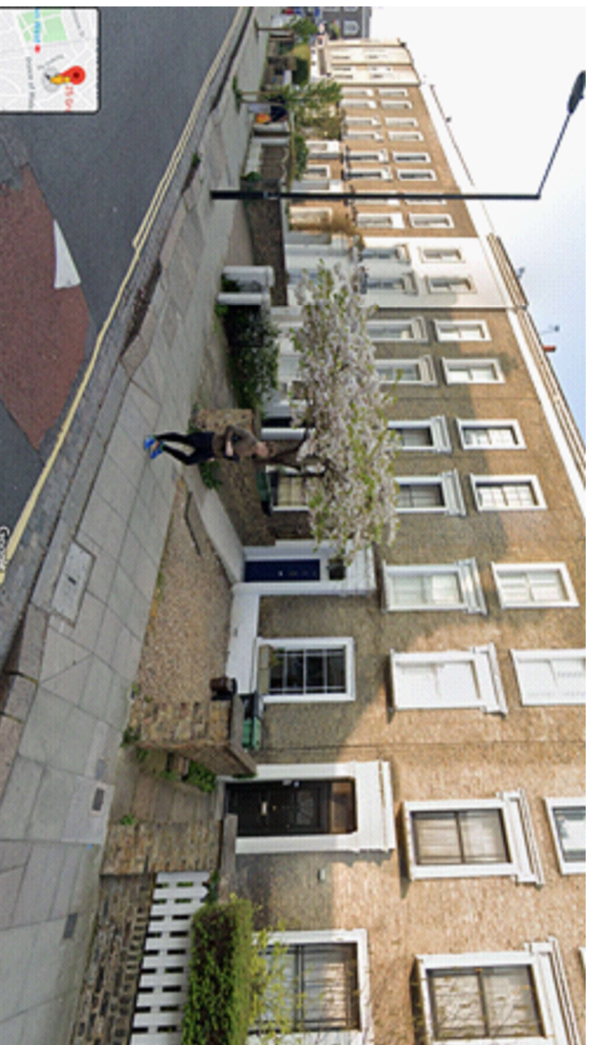
EXAMPLE OF THREE NEIGHBOURING PROPERTIES WITH A DROP KERB (SIDE VIEW)