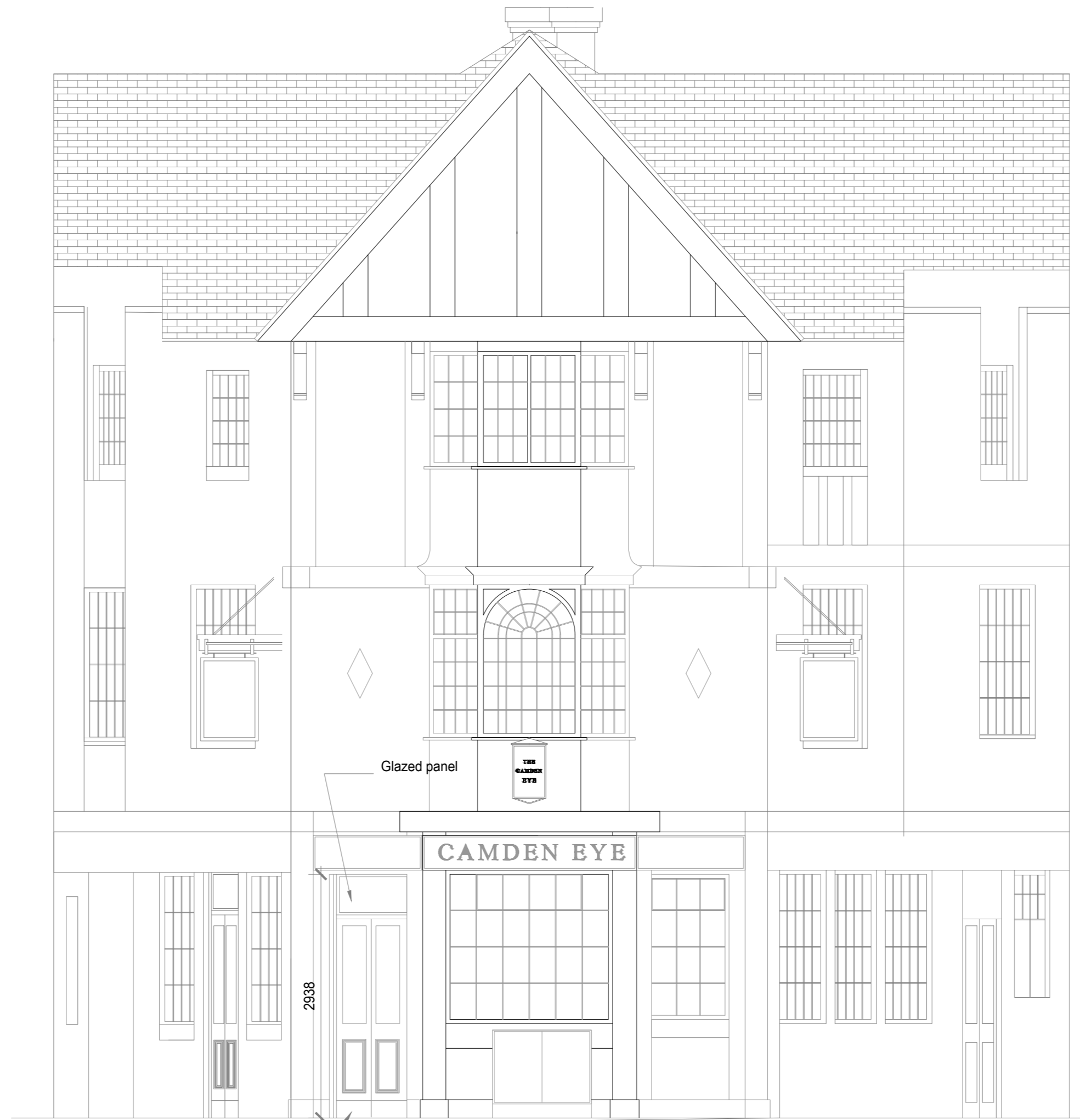
Proposed Front Elevation 1:50

Proposed double doors (2450x 1120), details to be matched with existing doors