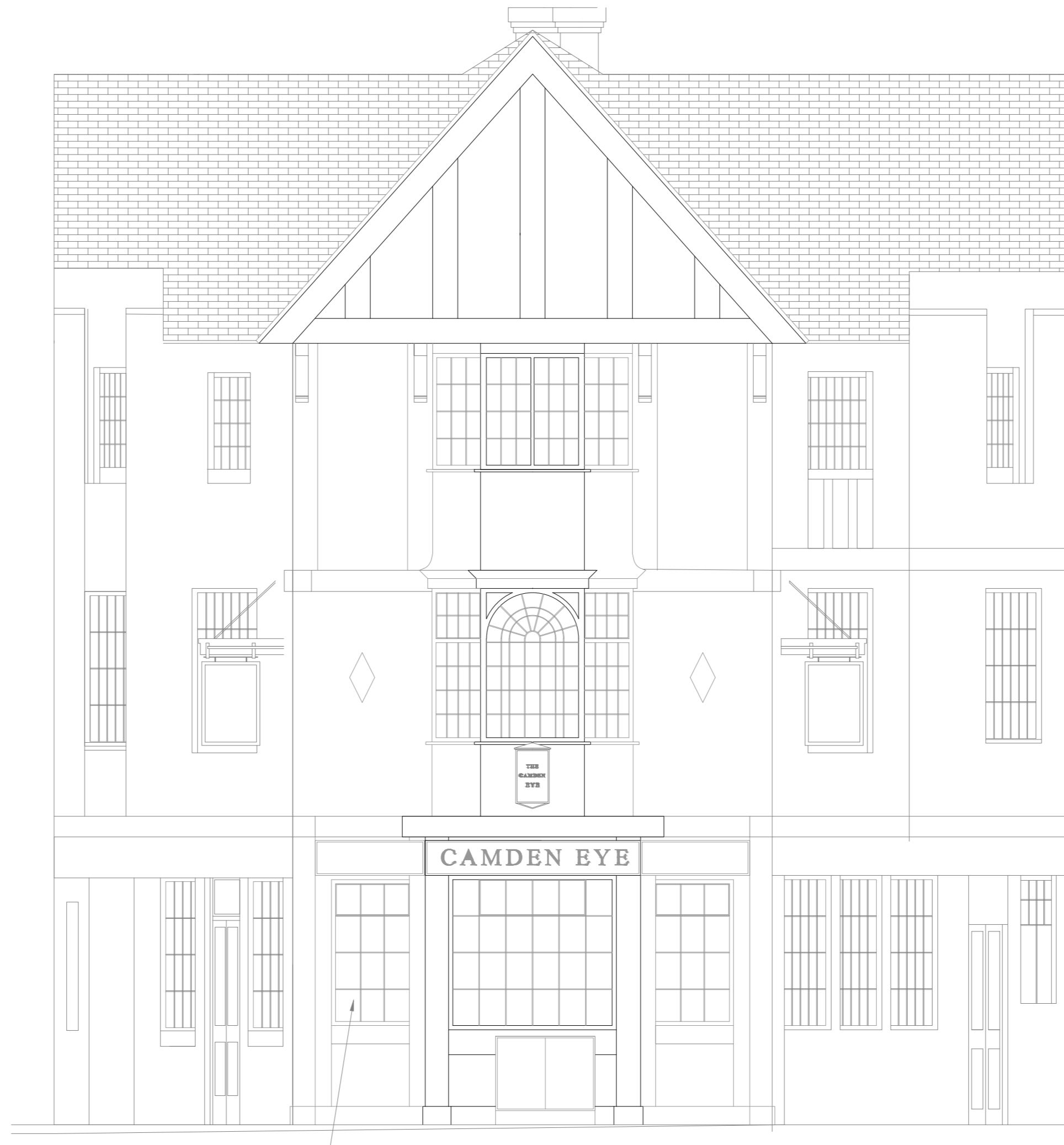
Existing Front Elevation 1:50

Existing window to be replaced with double doors and a glazed panel above, matching existing door on the left