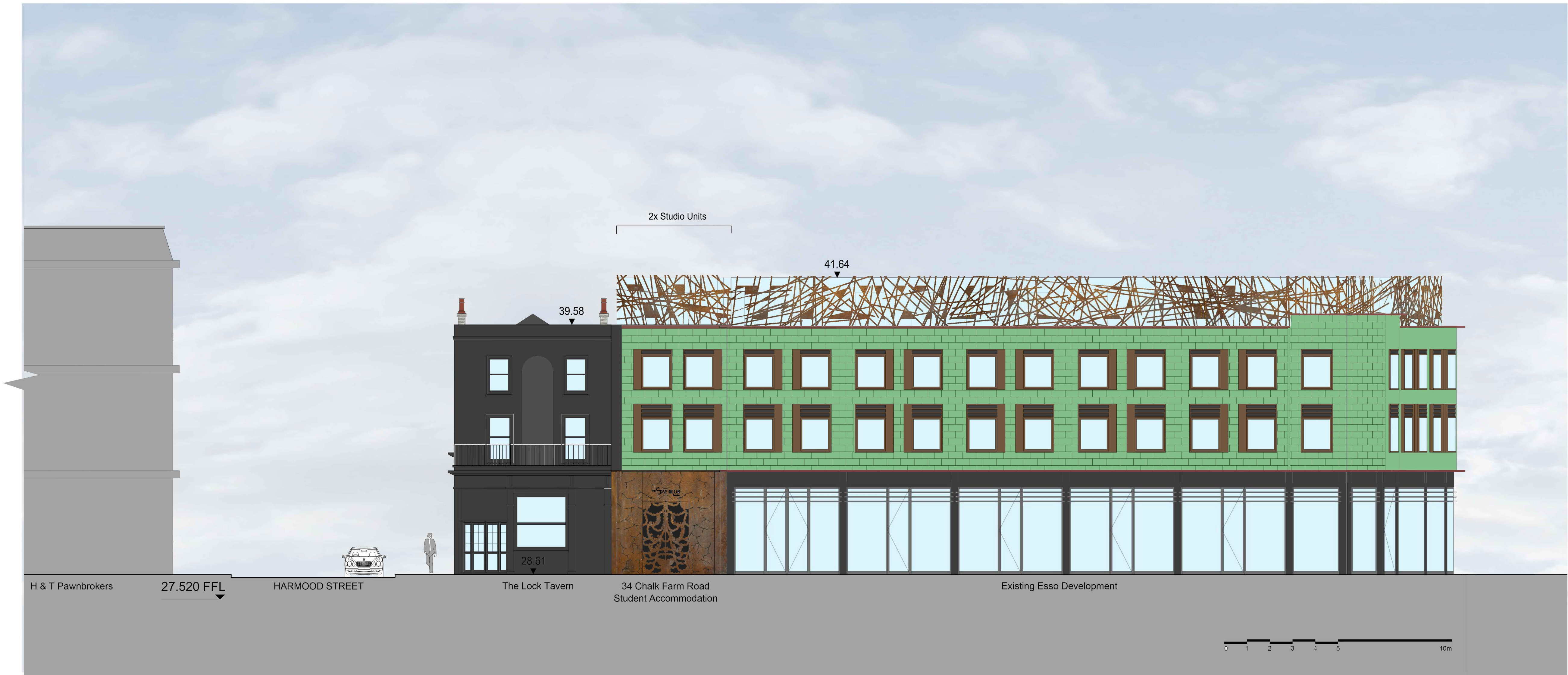
Chalk Farm Rd Street Elevation as built