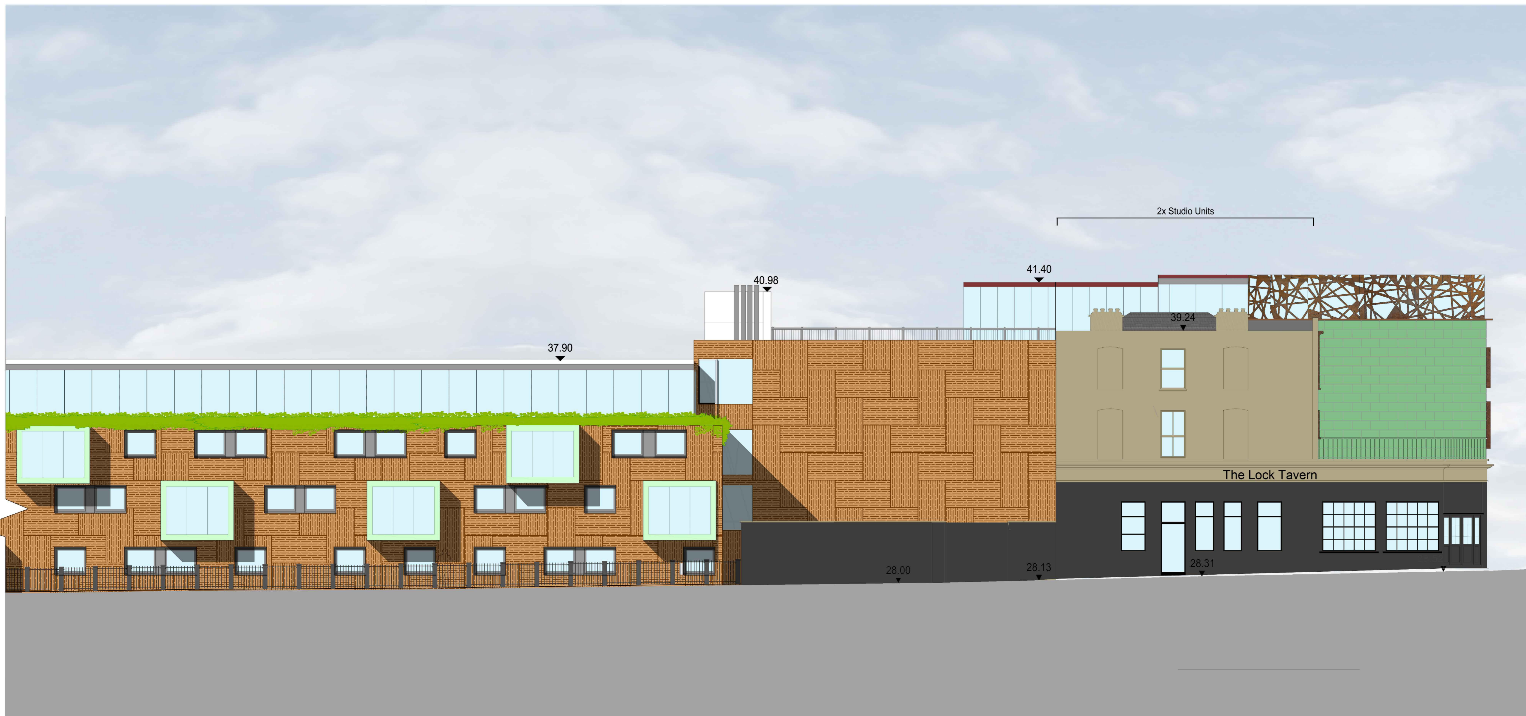
Harmond Street Elevation as built