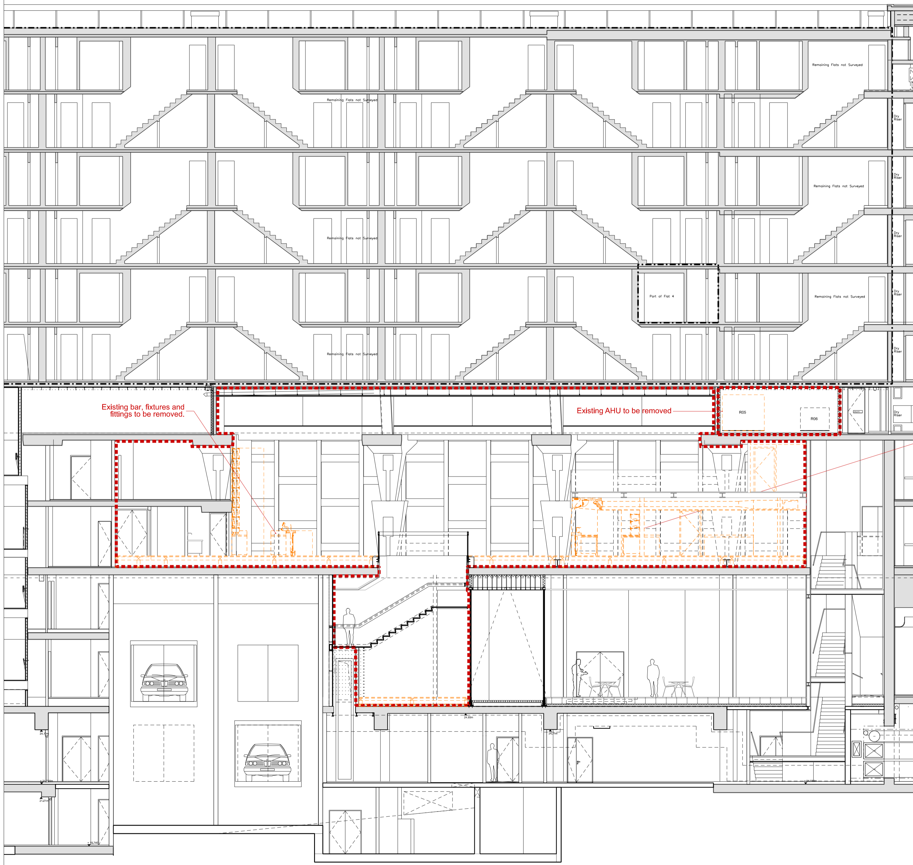
Section EE 709-19121 Centre Point House White Lion House →