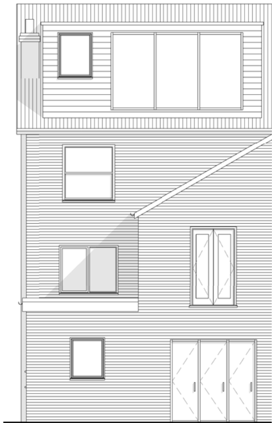
3 Existing Rear Elevation X001 1:100