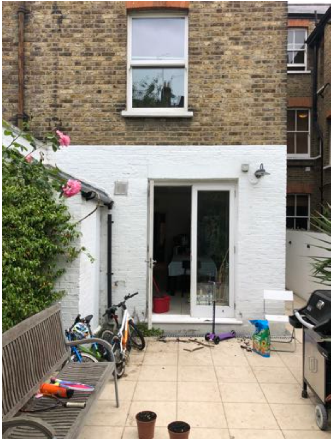
Photograph from the rear garden