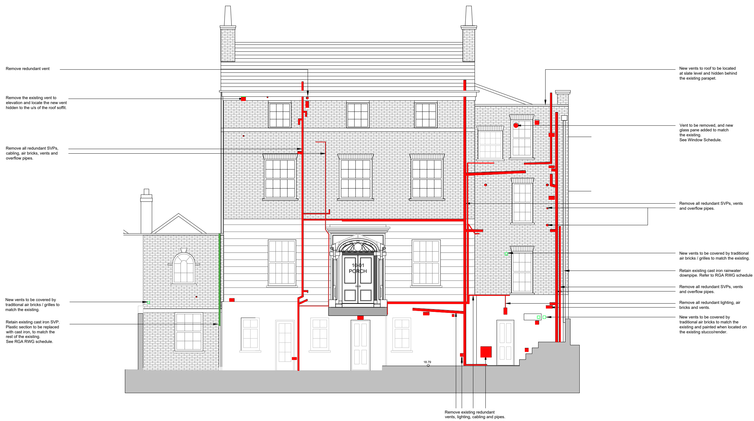
01 NORTH ELEVATION REPAIRS AS PROPOSED SCALE 1:50 @ A1, 1:100 @ A3

DO NOT SCALE FROM THIS DRAWING DRAWING TO BE READ IN CONJUNCTION WITH ALL OTHER ARCHITECTS AND ENGINEERS CONTRACT DRAWING & SPECIFICATIONS. ANY DISCREPANCIES MUST BE BROUGHT TO THE ATTENTION OF THE ARCHITECT IMMEDIATELY. THE CONTRACTOR MUST VERIFY ALL DIMENSIONS BY SITE MEASUREMENT BEFORE ORDERING MATERIALS OR MANUFACTURING COMPONENTS. SUBSTITUTE MATERIALS & PRODUCTS TO THOSE NAMED WILL BE ACCEPTABLE IF PROVEN TO BE OF EQUAL OR HIGHER PERFORMANCE AND NOT IN CONFLICT WITH OTHER ELEMENTS. NOTES