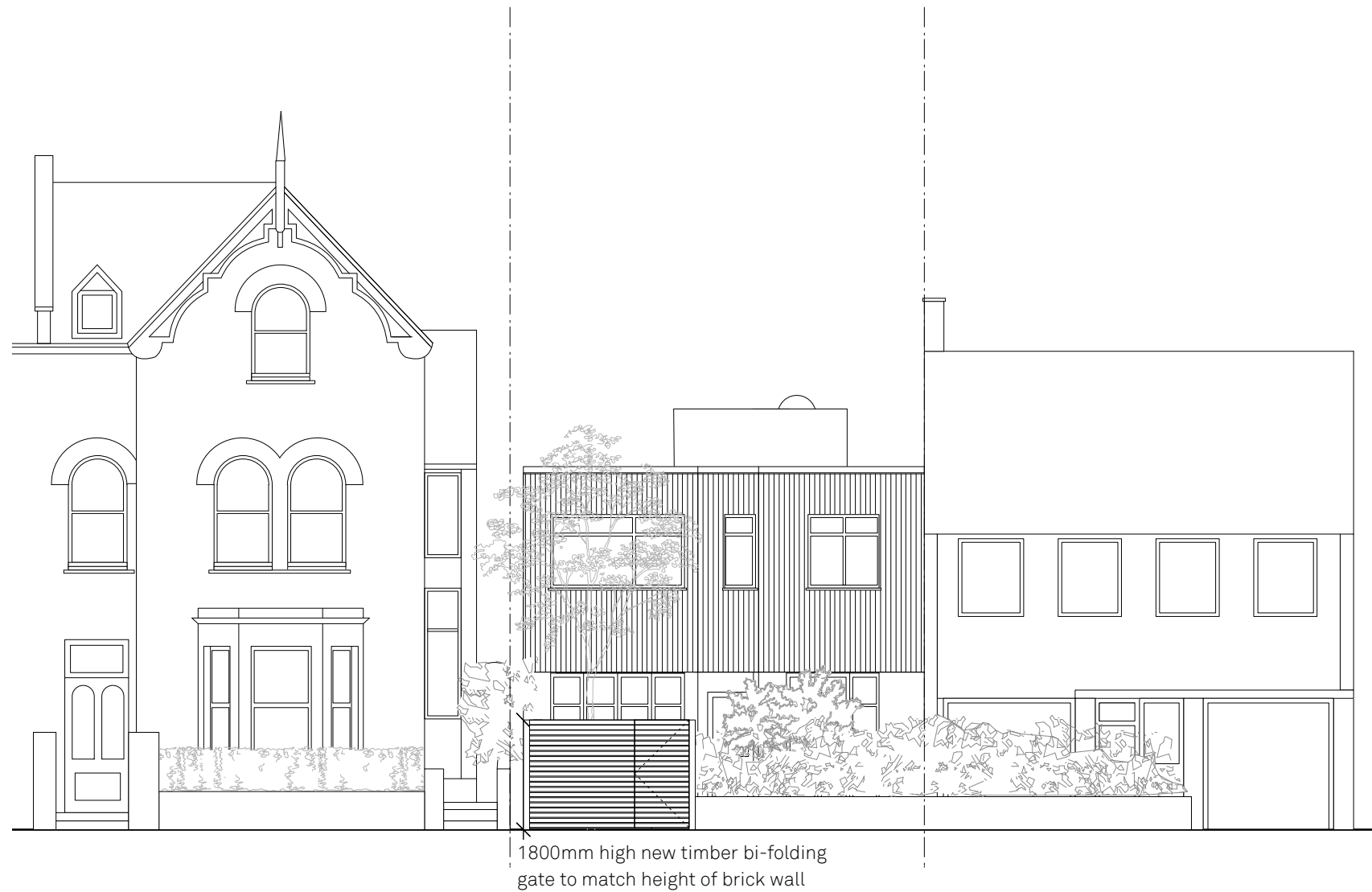
Rudall Crescent no. 25 (not surveyed)