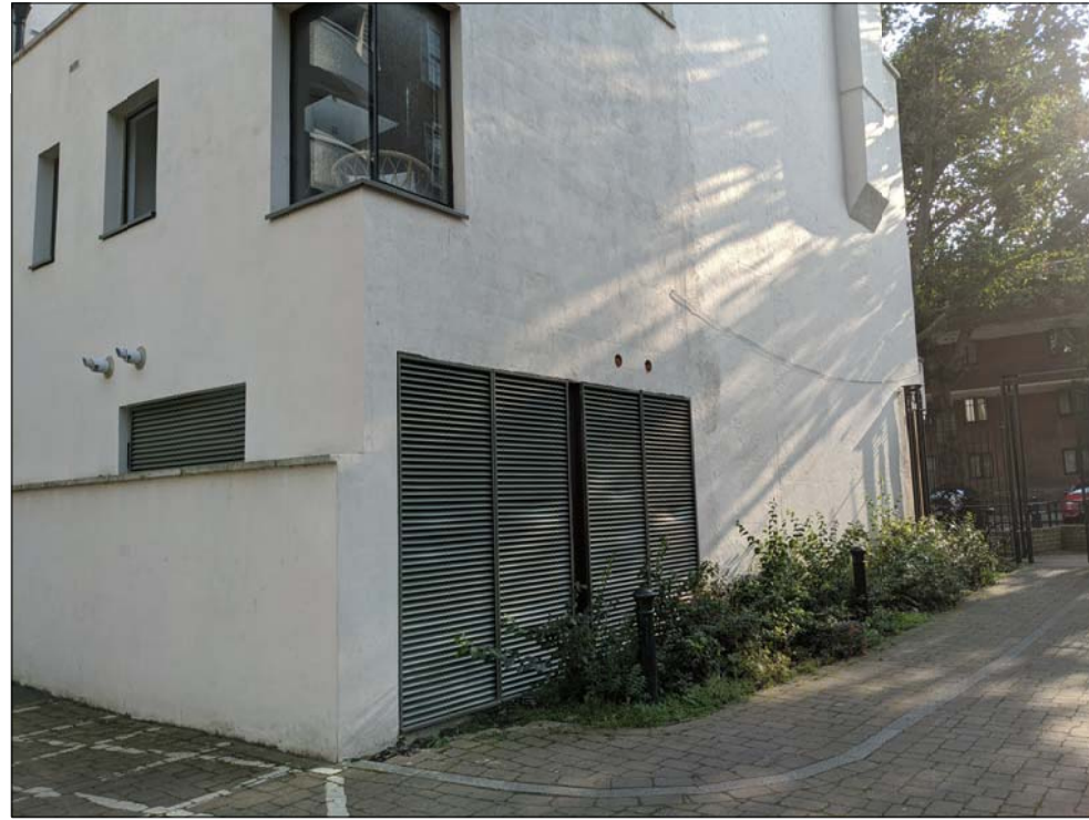
1 EXISTING VIEW TOWARDS FLANK WALL AND PEDESTRIAN ACCESS GATE PL500 NTS