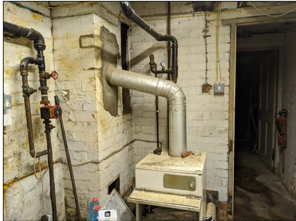
4 EXISTING PLANT ROOM PL500 NTS