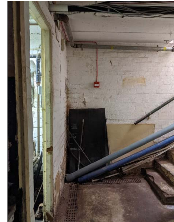
5 EXISTING VIEW OF PROPOSED BOILER LOCATION IN BASEMENT PL500 NTS