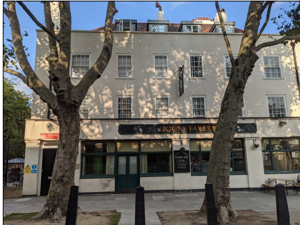
5 EXISTING VIEW COCK TAVERN FROM CHALTON ROAD PL500 NTS