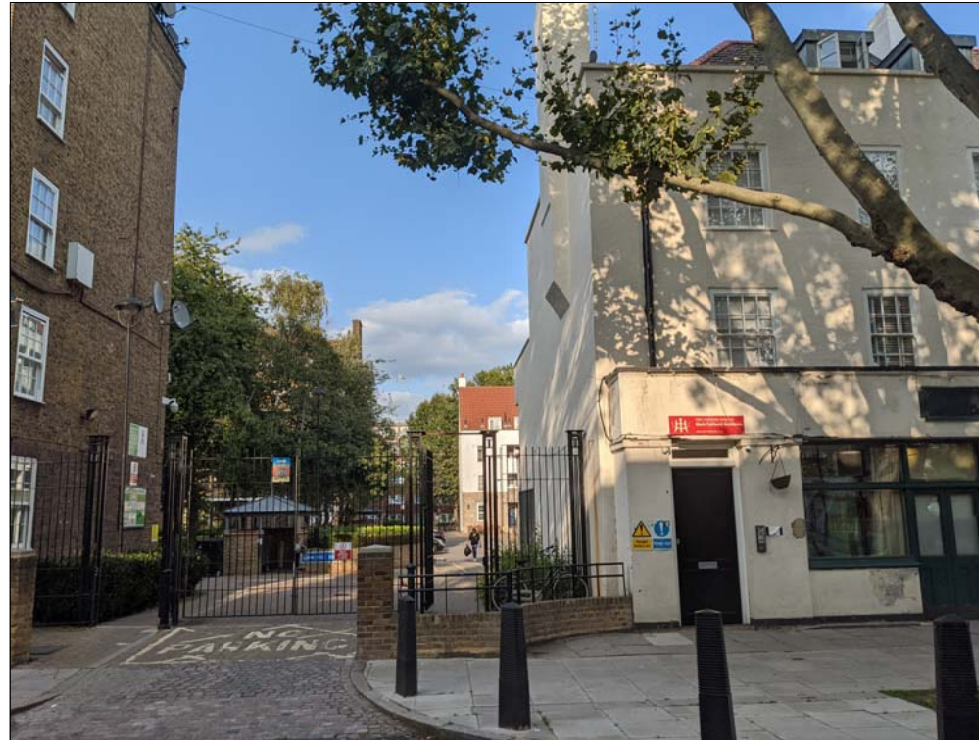
2 VIEW TOWARDS COCK TAVERN FROM CHALTON ROAD PL500 NTS