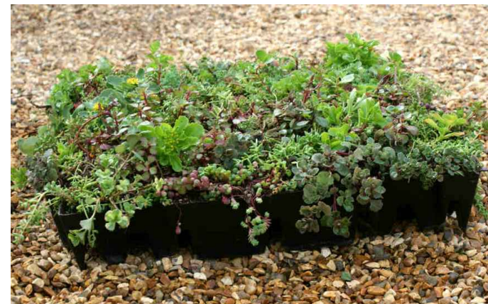
Typical Sedum Pod Image