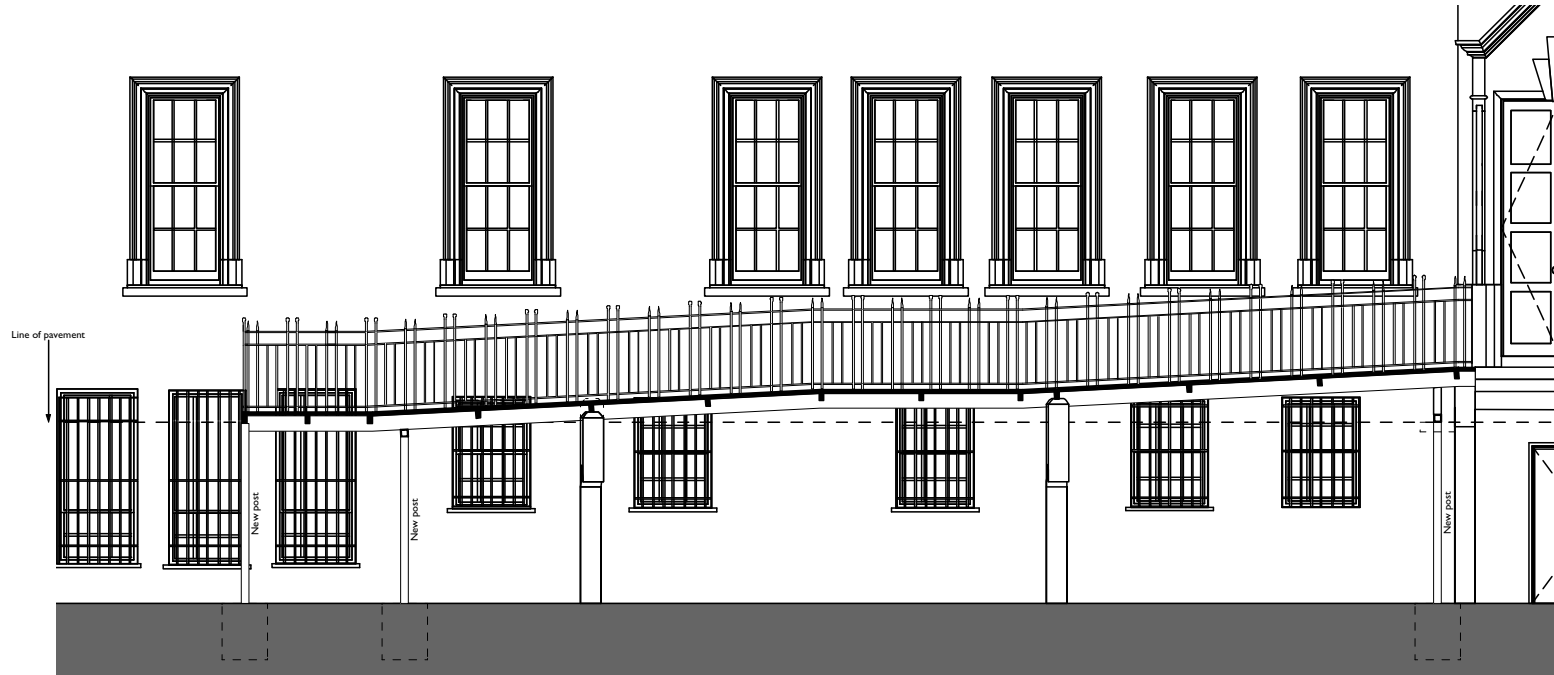
RAMP SECTION BB 1:100 @ A3