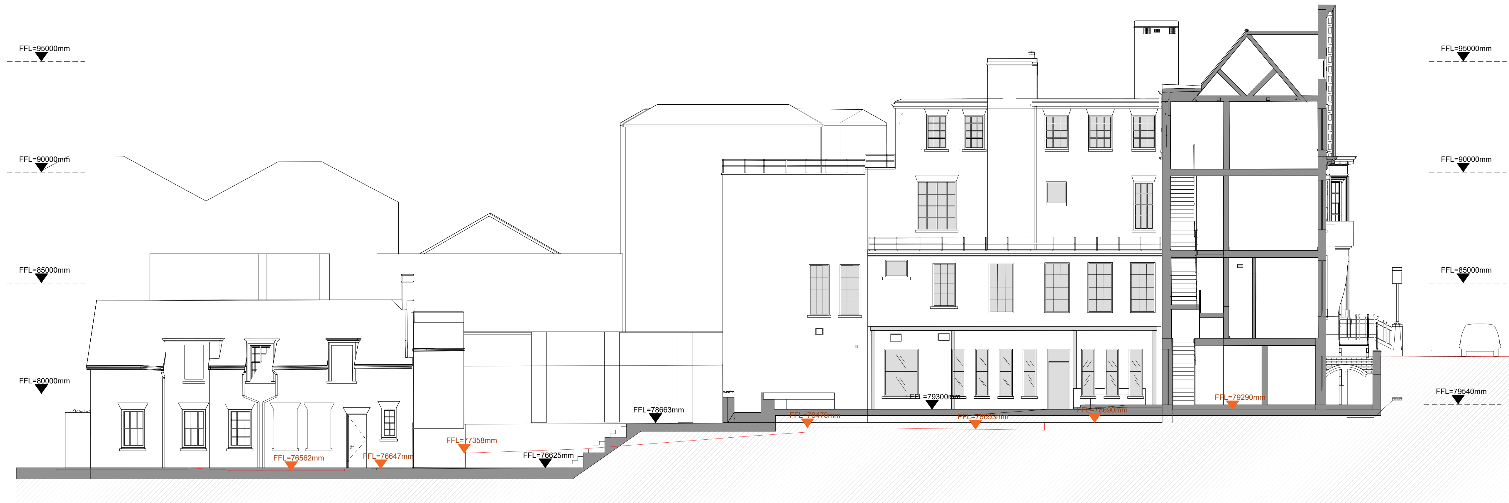
PROPOSED Section BB'