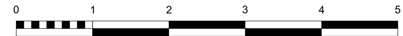
2 PROPOSED SHOPFRONT SECTION THROUGH Scale: 1:25@A1/1:50@A3