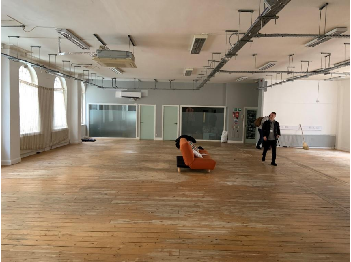
15. First floor looking south.