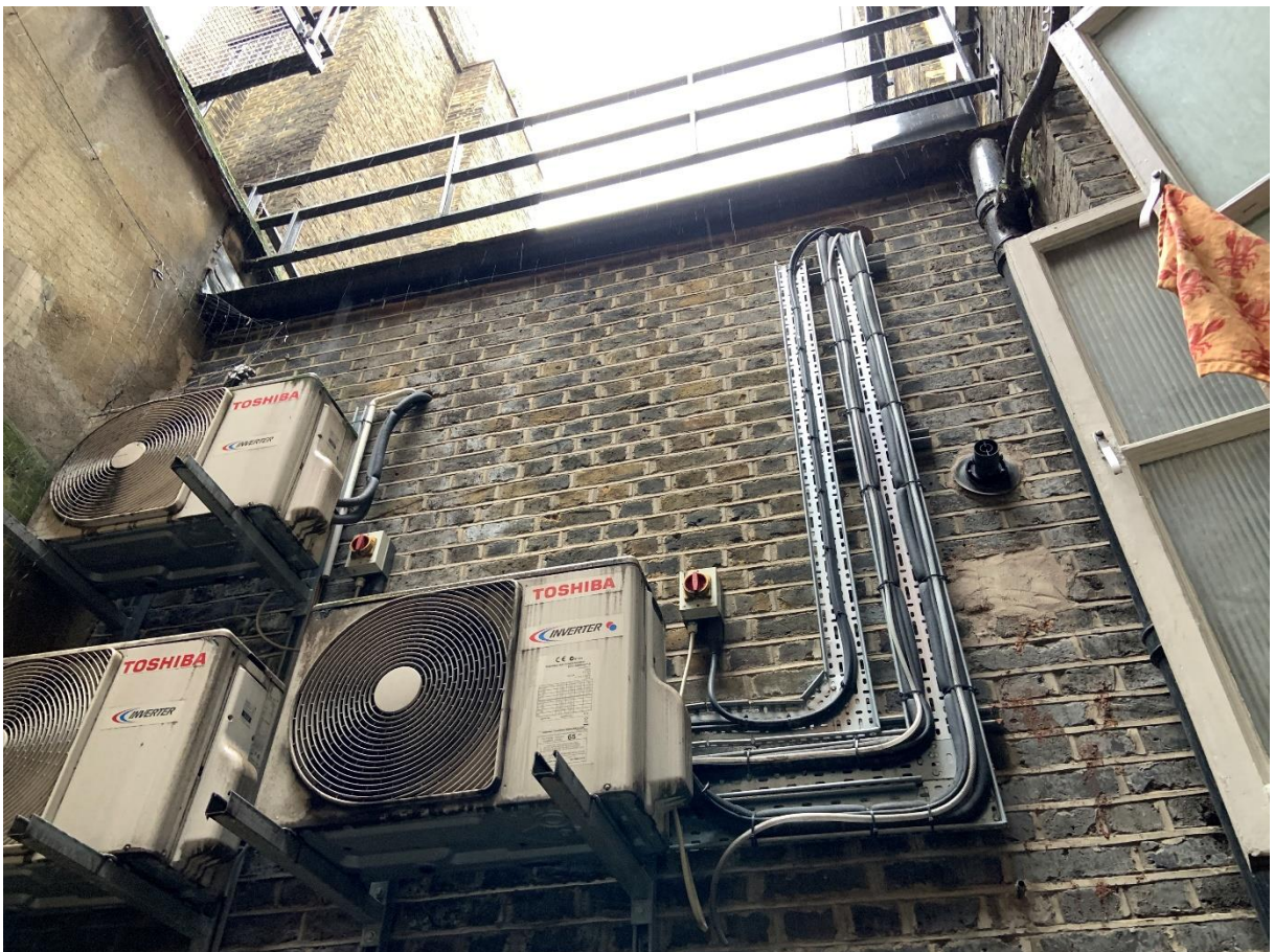
28. No. 26 lightwell looking south.