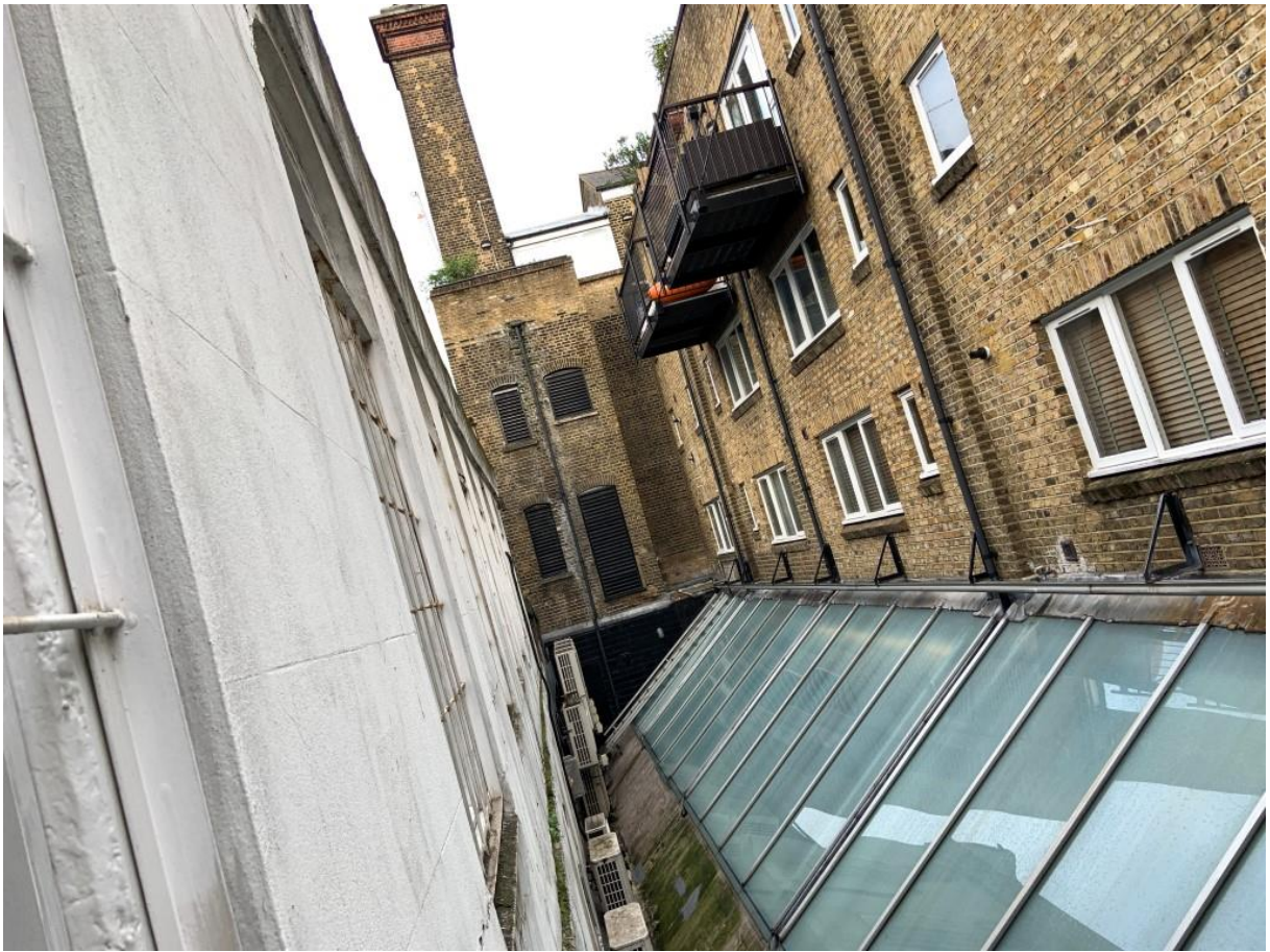
9. Rear (east) elevation of no. 24 to left side.