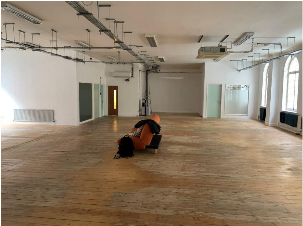
16. First floor looking north.