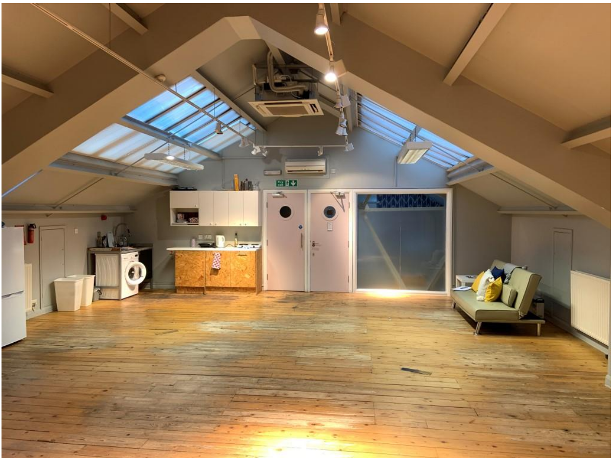
10. Second floor office areas.