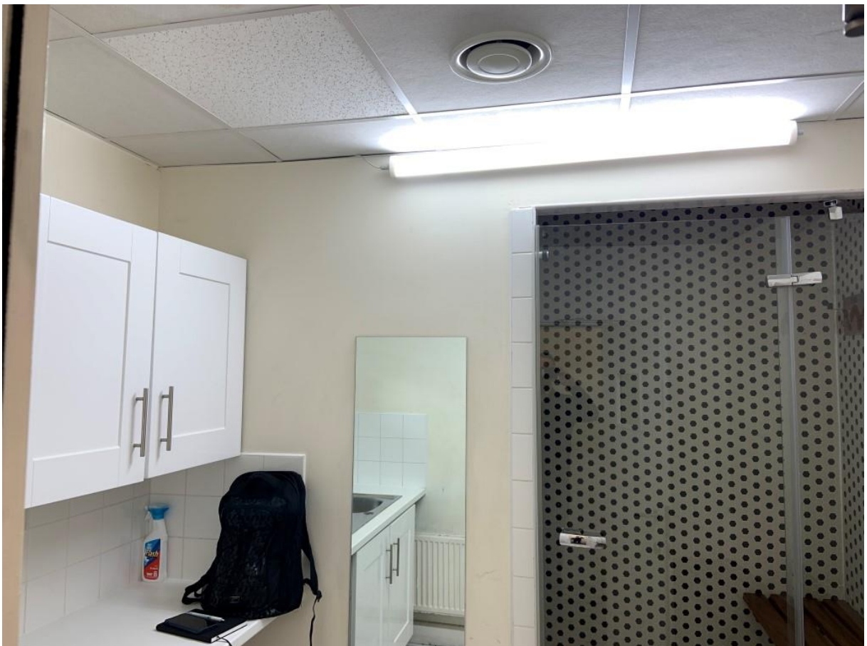
20. Ground floor shower room to north core.