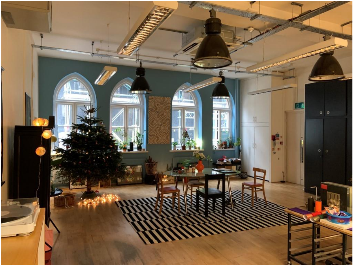
23. Office areas of no. 26.