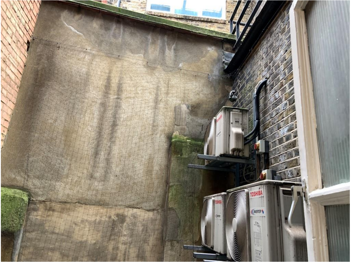
27. No. 26 lightwell looking east.