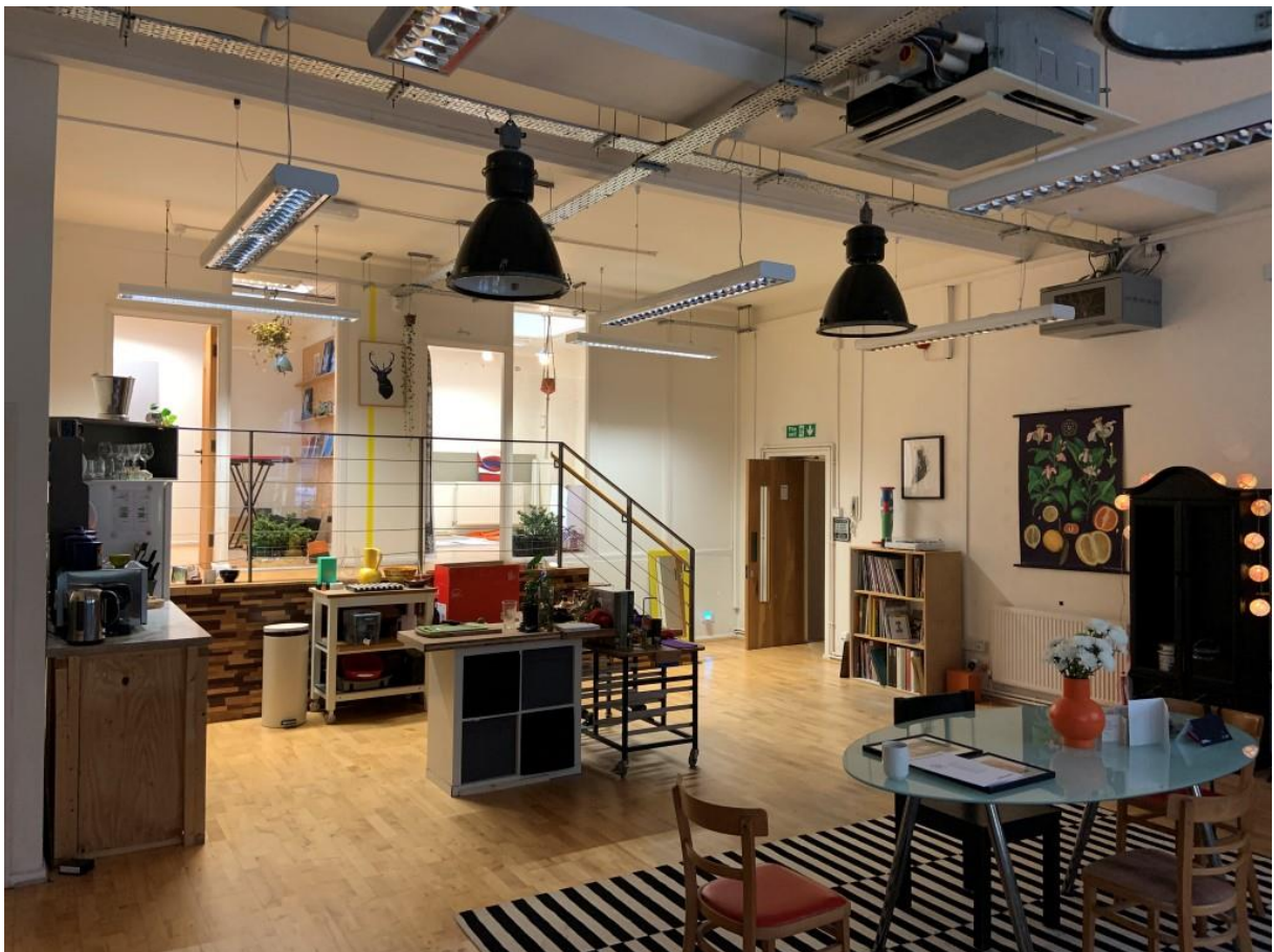
24. Office areas of no. 26.