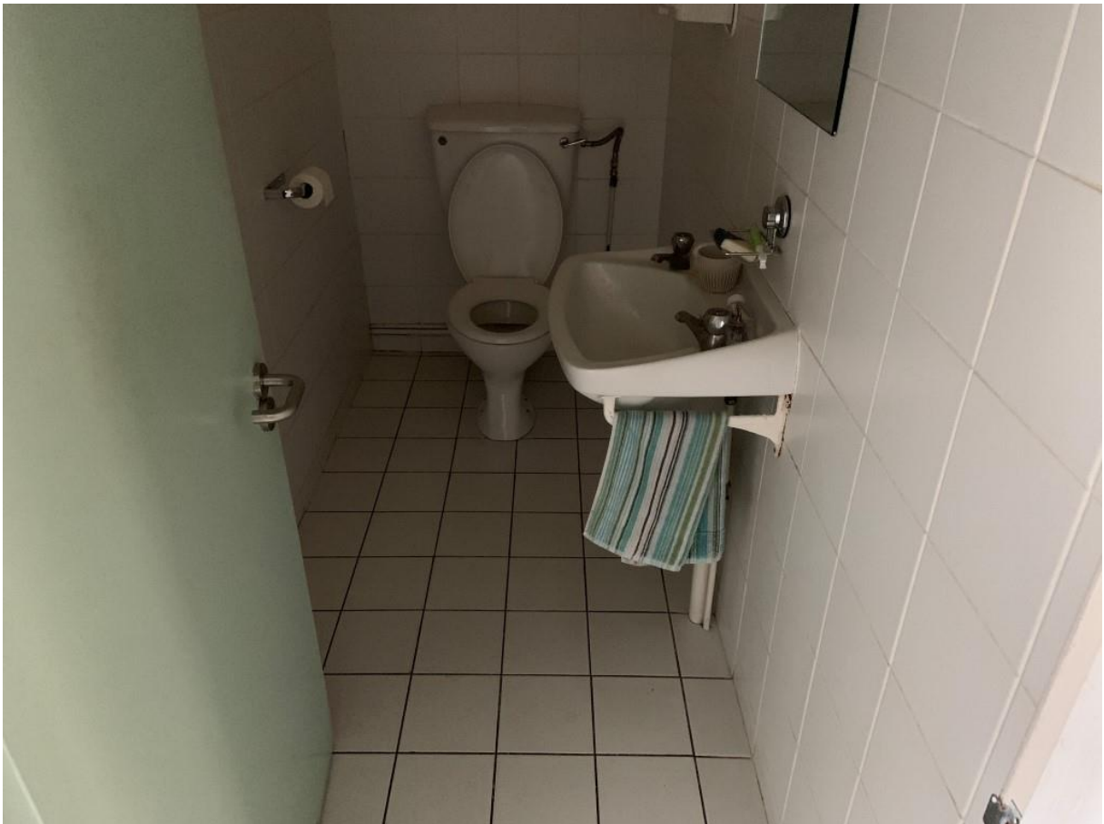
18. WC to north core.