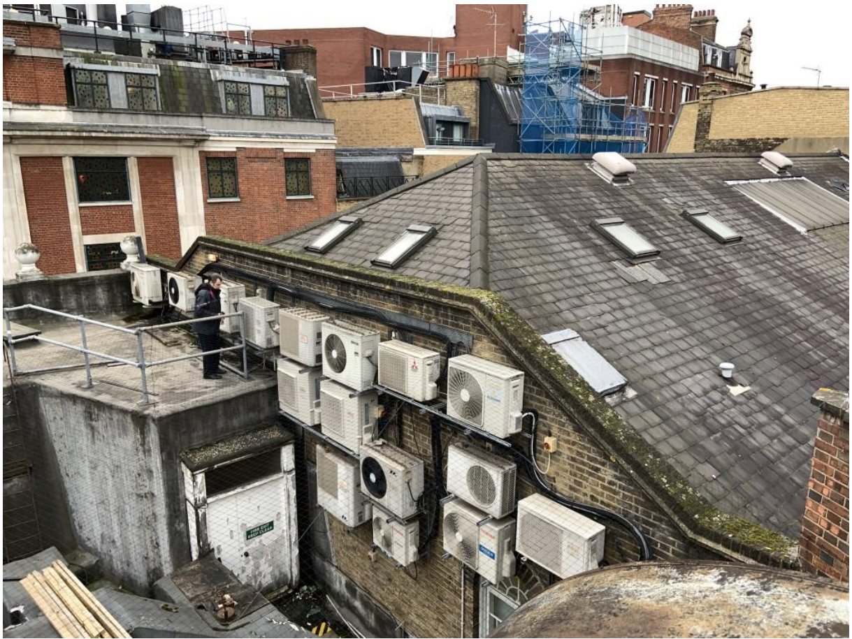
5. South gable wall of no. 24 and neighbouring theatre roof.