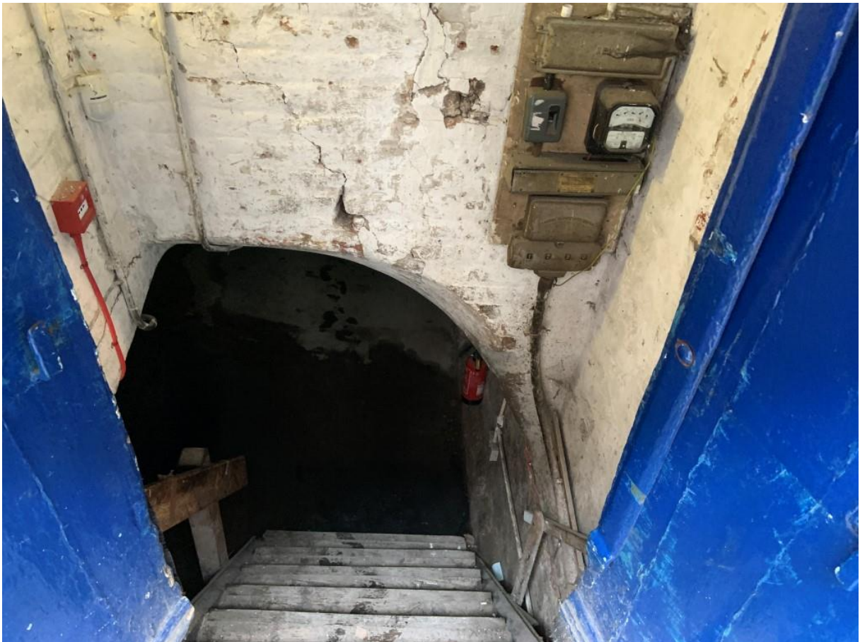
34. Basement access stairs from pavement level.