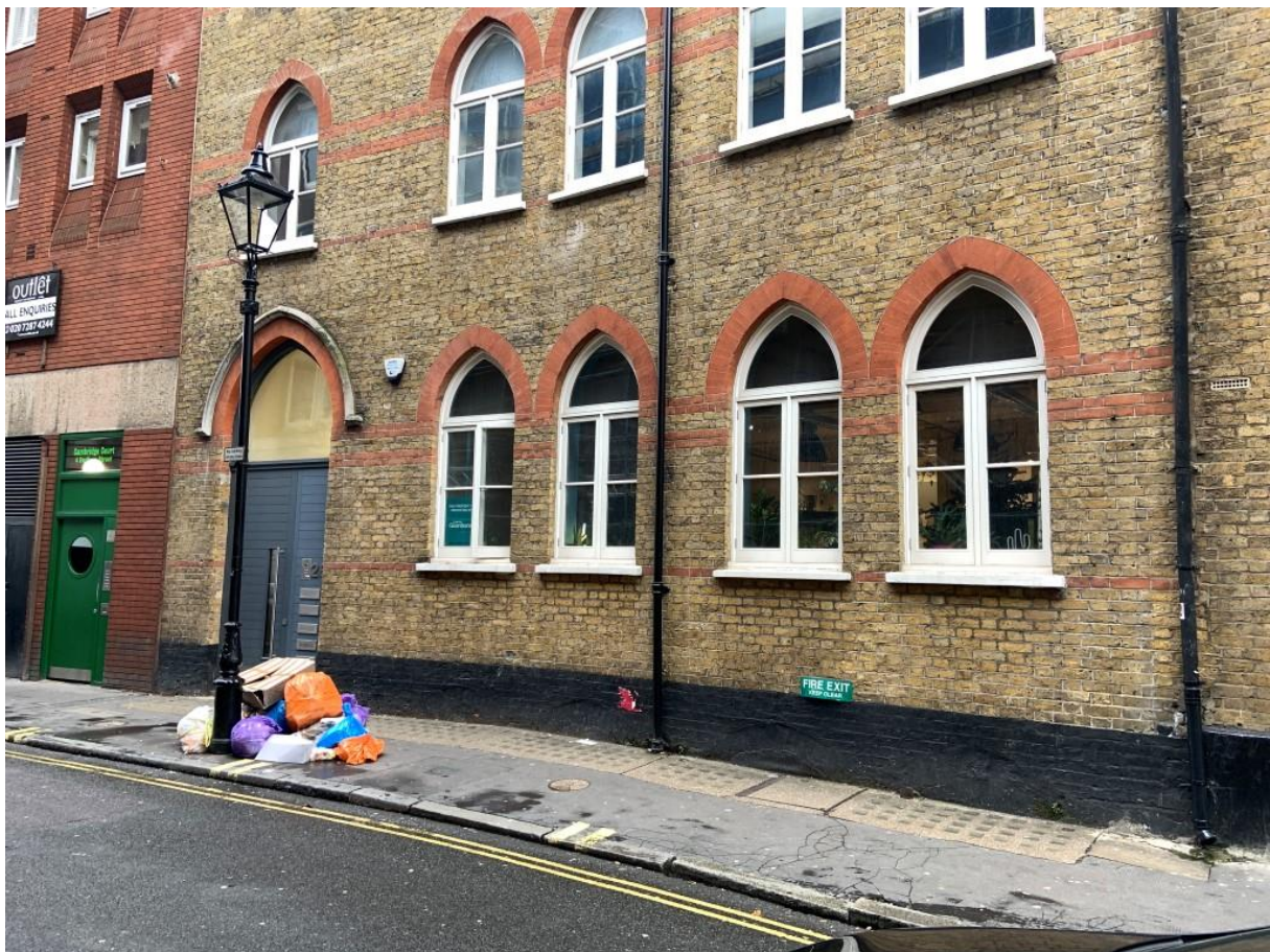
2. Front elevation of 26 West Street.