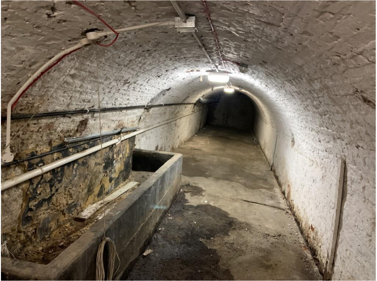
31. West basement vault to no. 24.