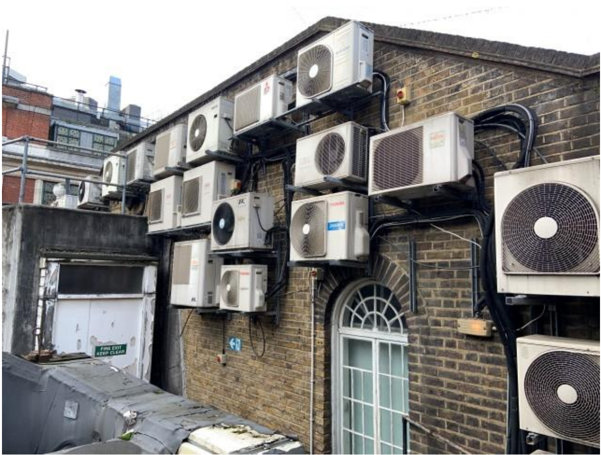
7. South gable wall of no. 24 and neighbouring theatre roof.