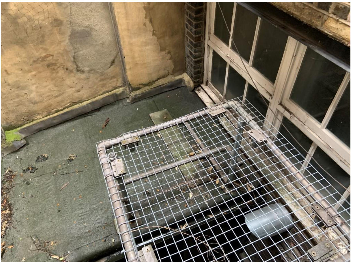
26. No. 26 lightwell with basement office windows to right side.