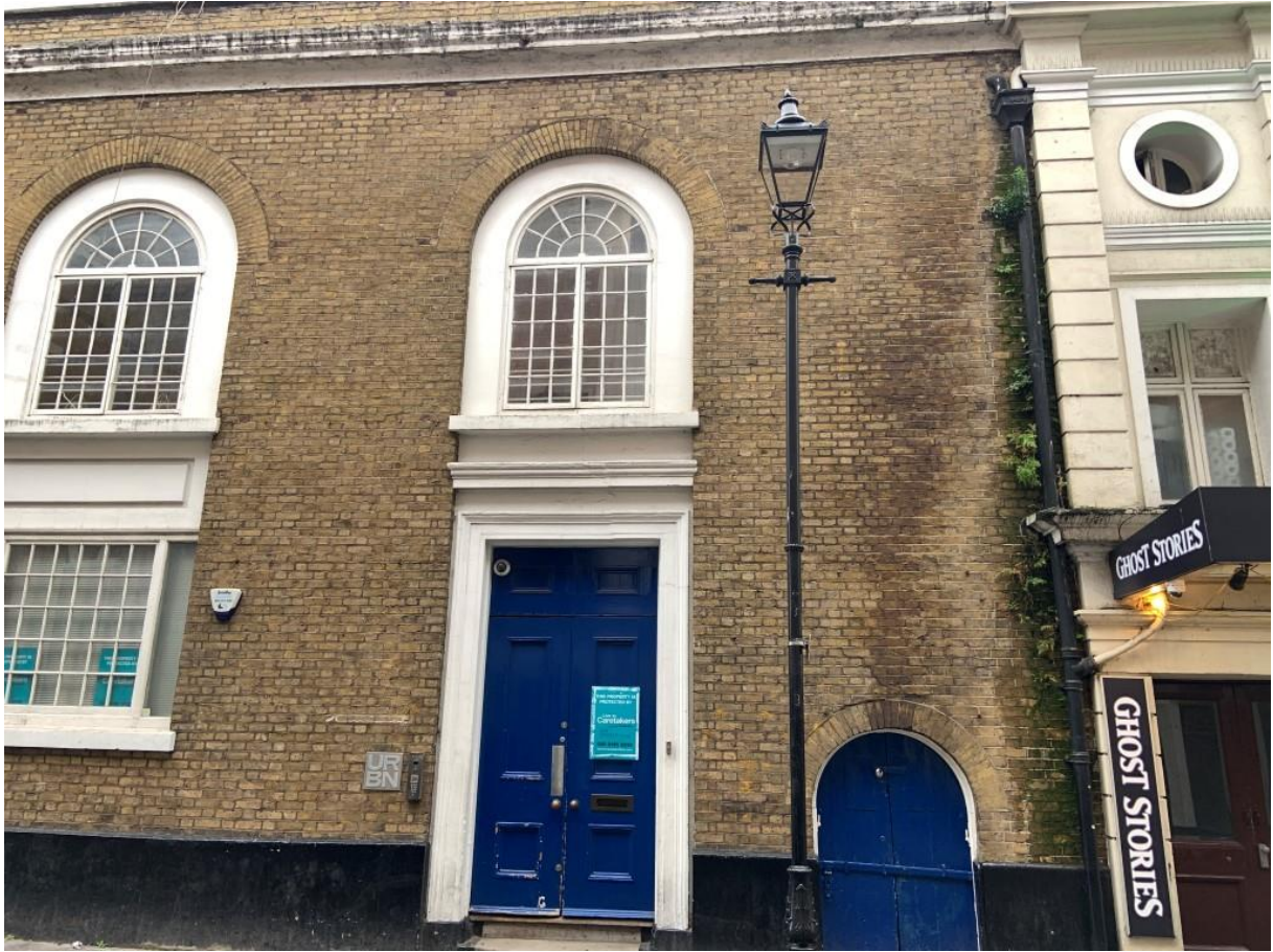
3. South entrance and basement door to 24 West Street.