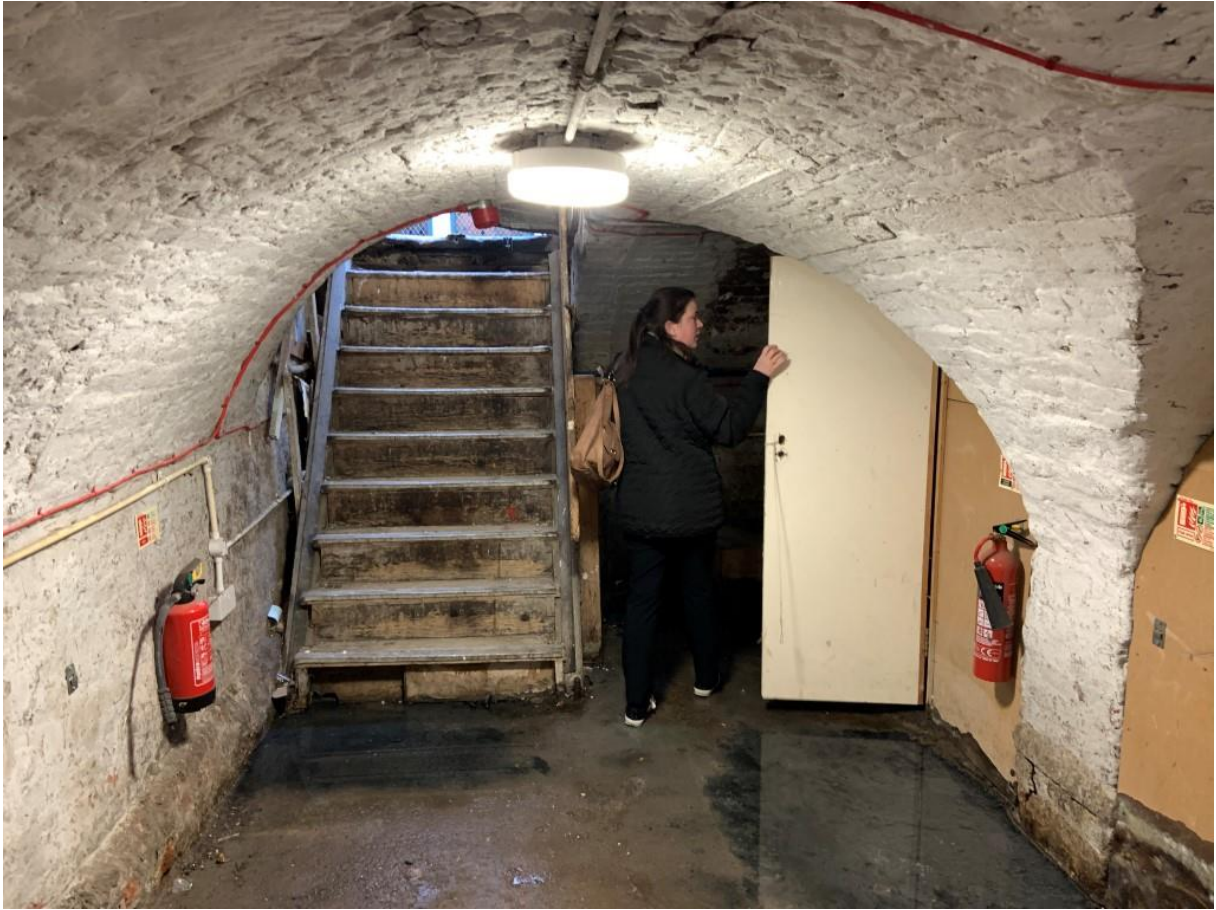
33. Basement entrance stairs.