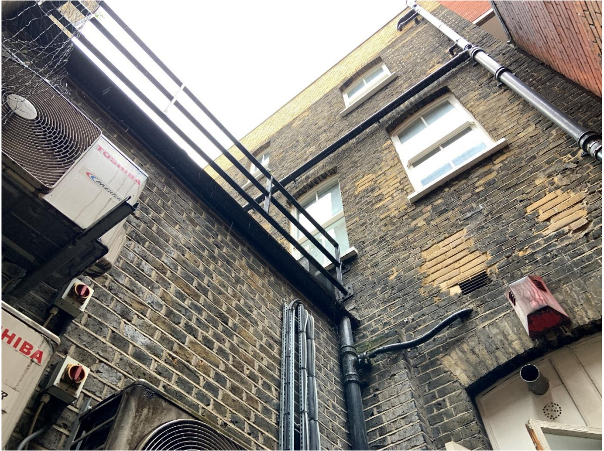
29. No. 26 lightwell and rear elevation of no. 26 upper parts.