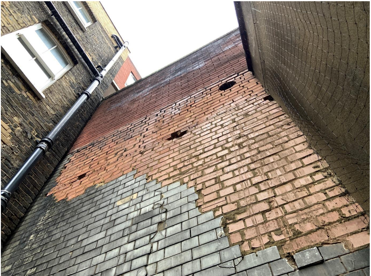
30. No. 26 lightwell looking north.