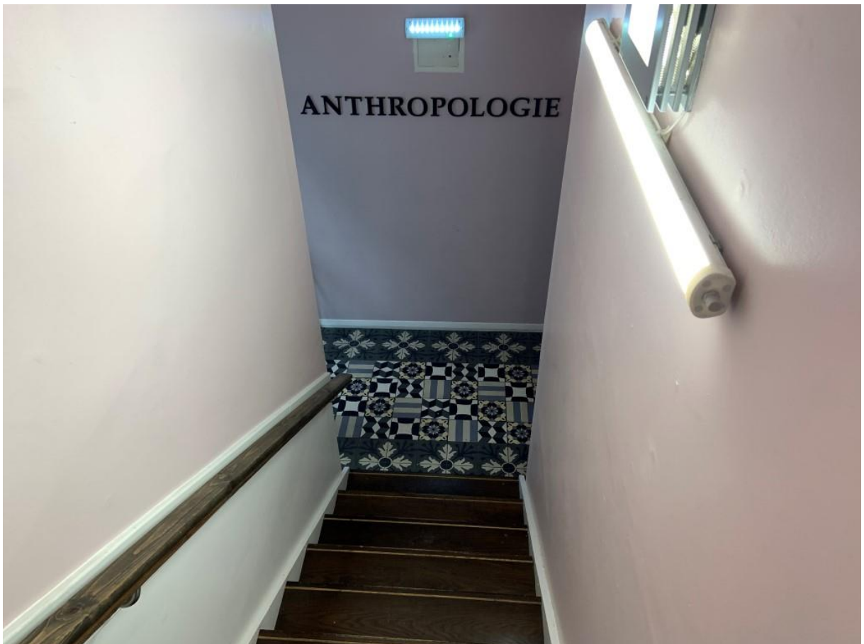
14. Stairs to no. 24 south core.