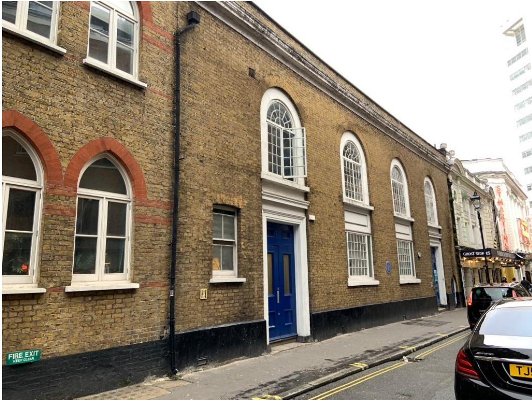
1. Front elevation of 24 West Street.