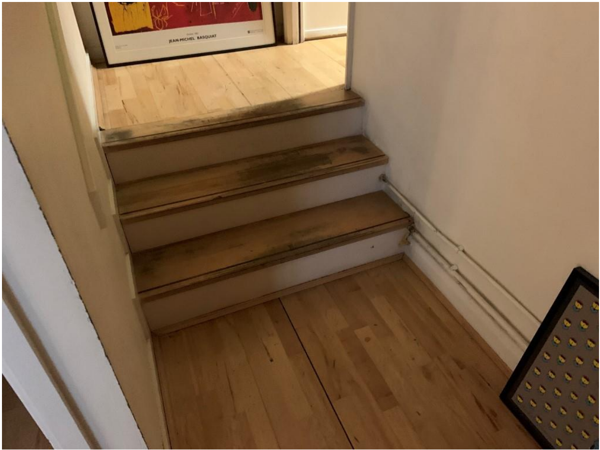
25. Stairs and opening between 24 & 26.