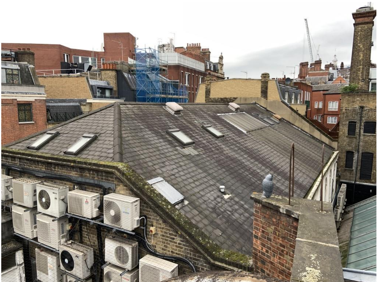
4. East & south pitch of main roof and part south gable wall to no. 24.