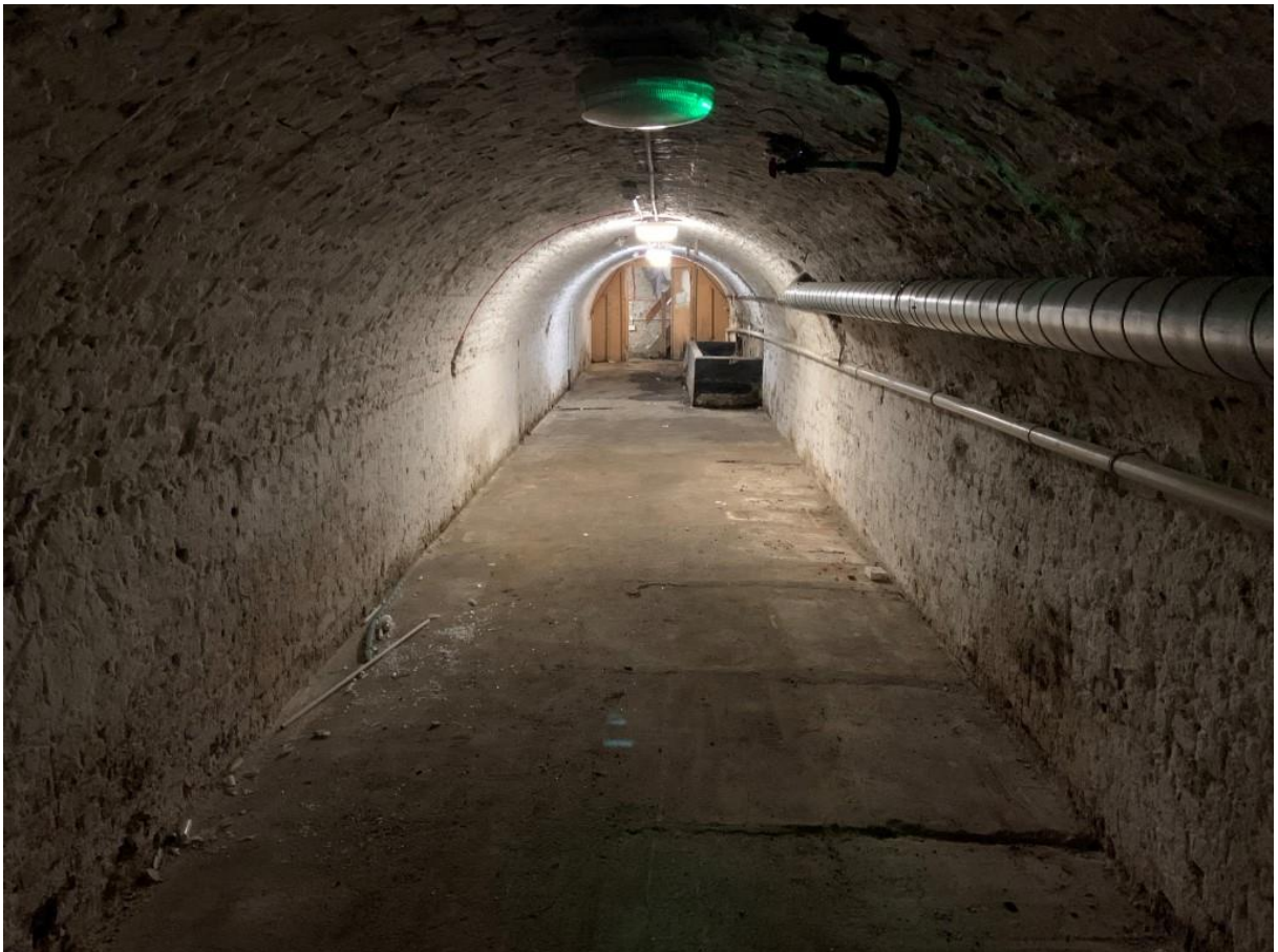
32. East basement vault to no. 24.