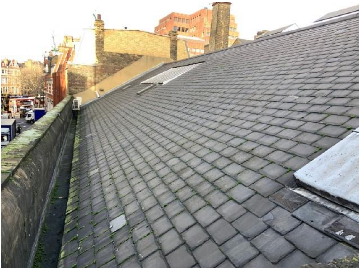
8. Front (west) pitch of no. 24.