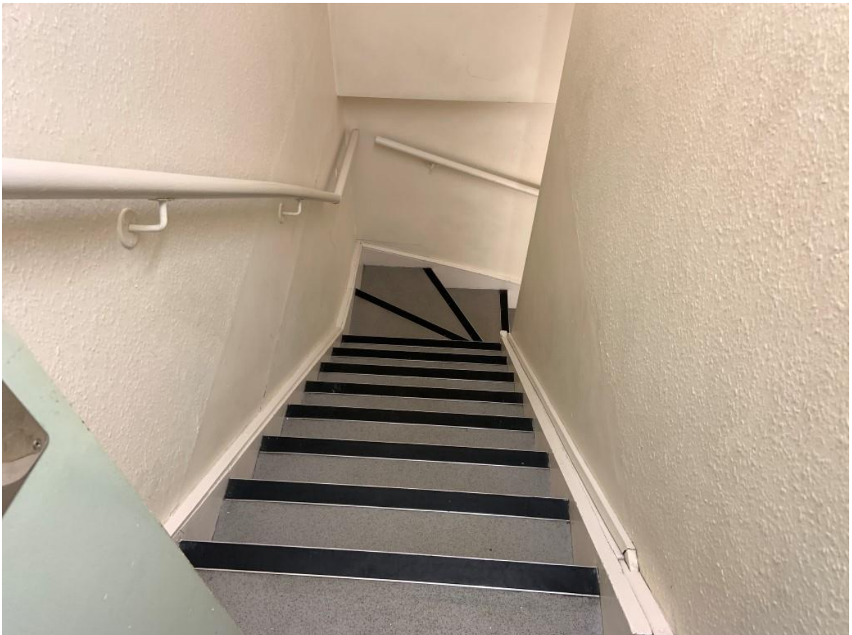
12. Stairs to no. 24 north core.