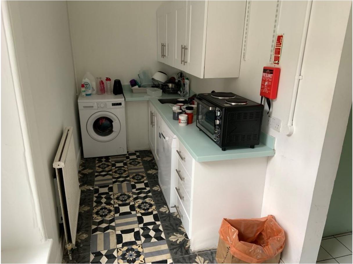
17. First floor kitchenette to north core.