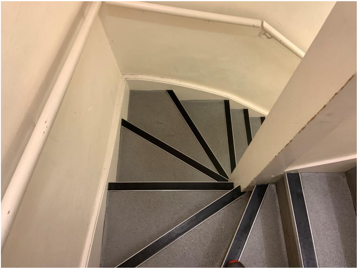
19. Stairs to north core.