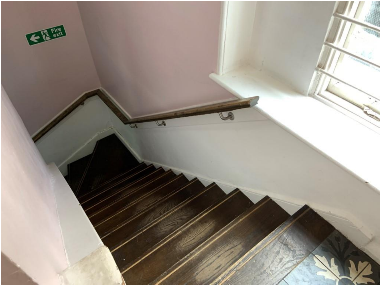
13. Stairs to no. 24 south core.