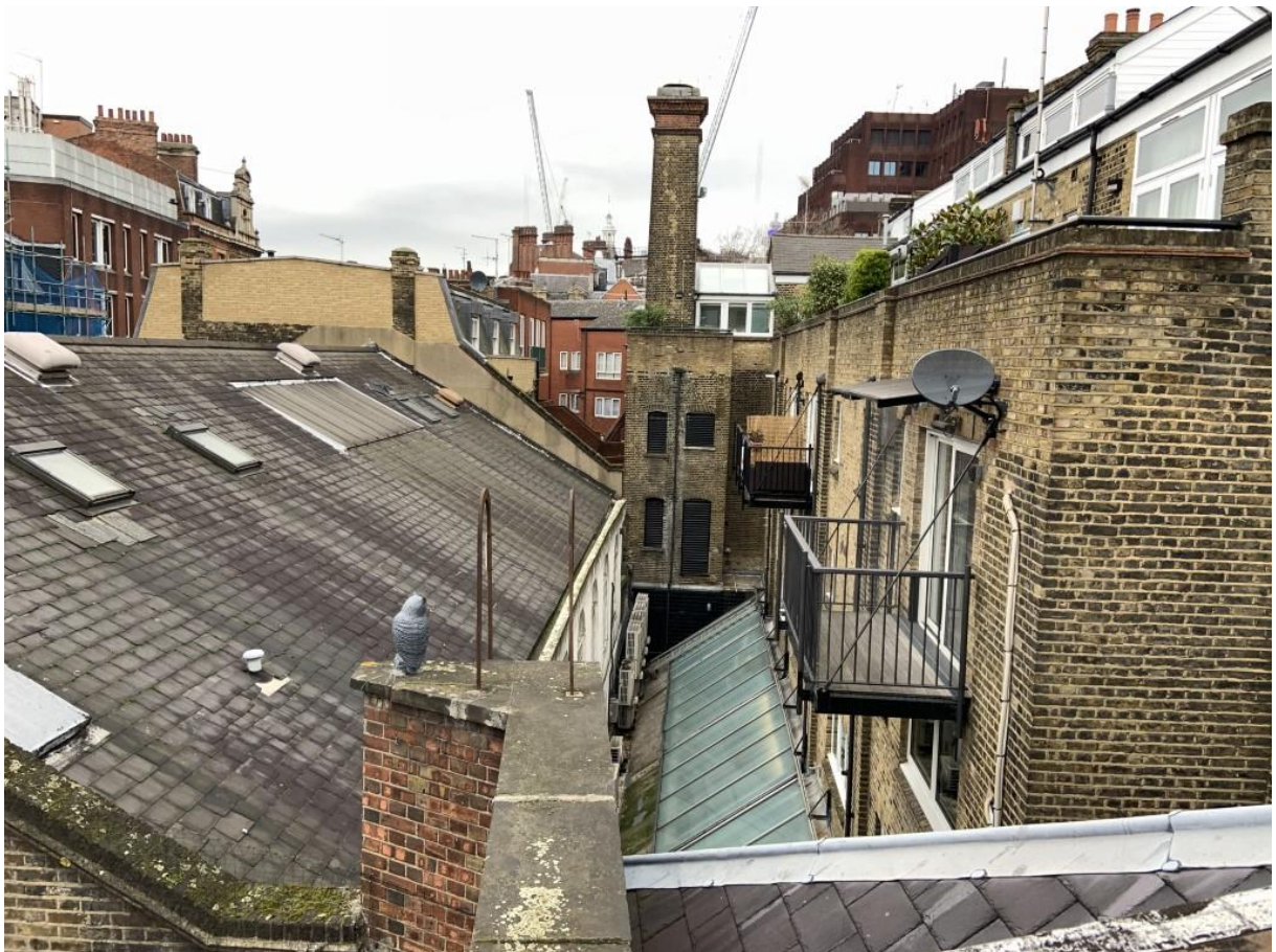
6. Rear (east) elevation of no. 24 with Tower Street property.