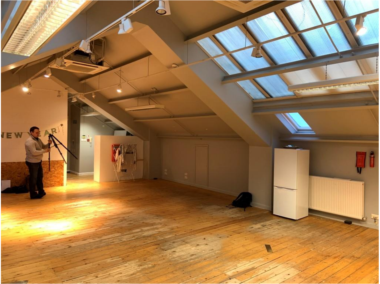
11. 2 nd floor office areas.