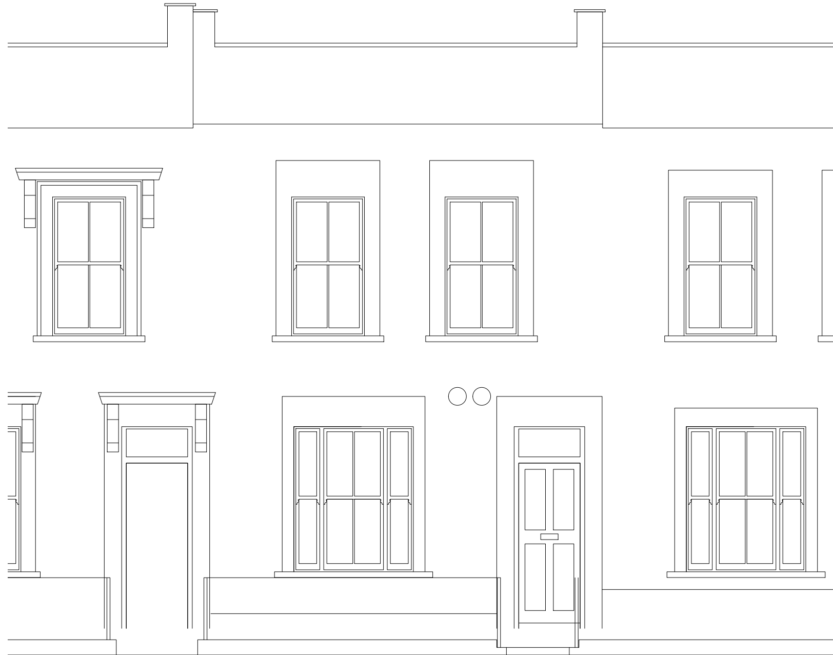
1 EXISTING FRONT ELEVATION 1 : 50

THIS DRAWING AND ANY DESIGNS INDICATED THEREON ARE THE COPYRIGHT OF THE ARCHITECT. ALL RIGHTS ARE RESERVED. NO PART OF THIS WORK MAY BE REPRODUCED WITHOUT PRIOR PERMISSION IN WRITING FROM THE ARCHITECT.