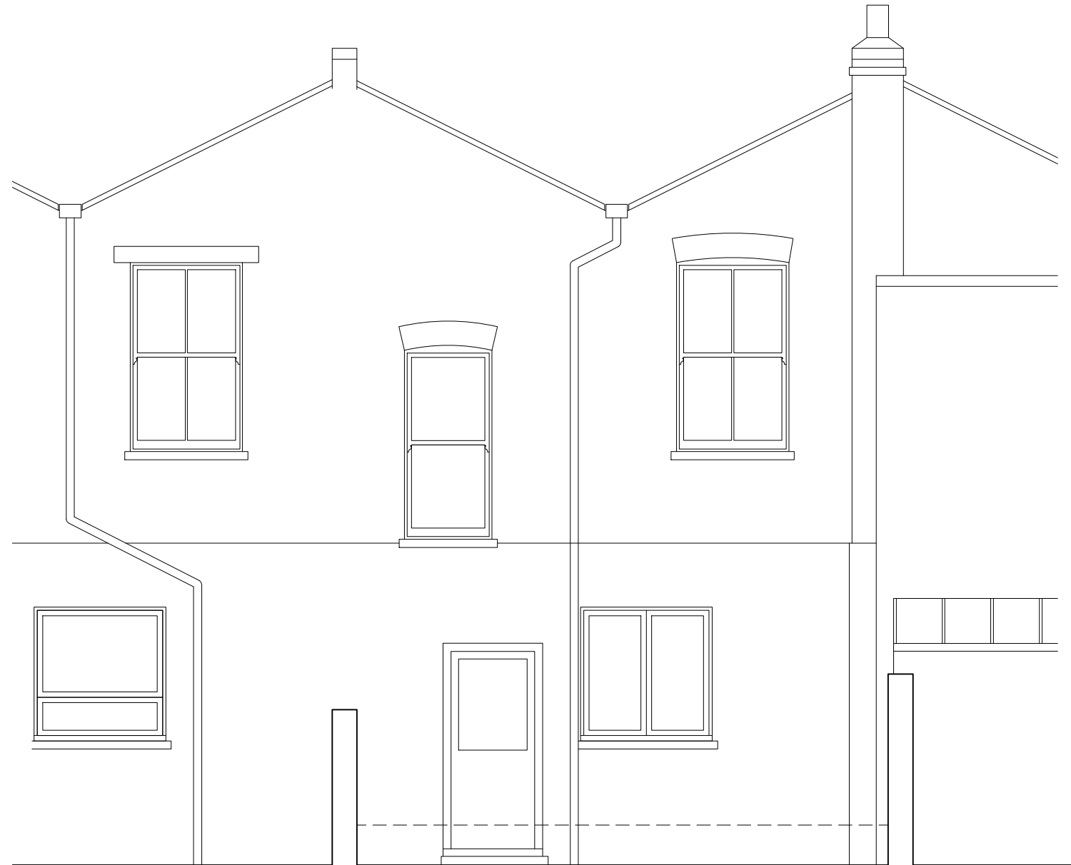
2 EXISTING REAR ELEVATION 1 : 50