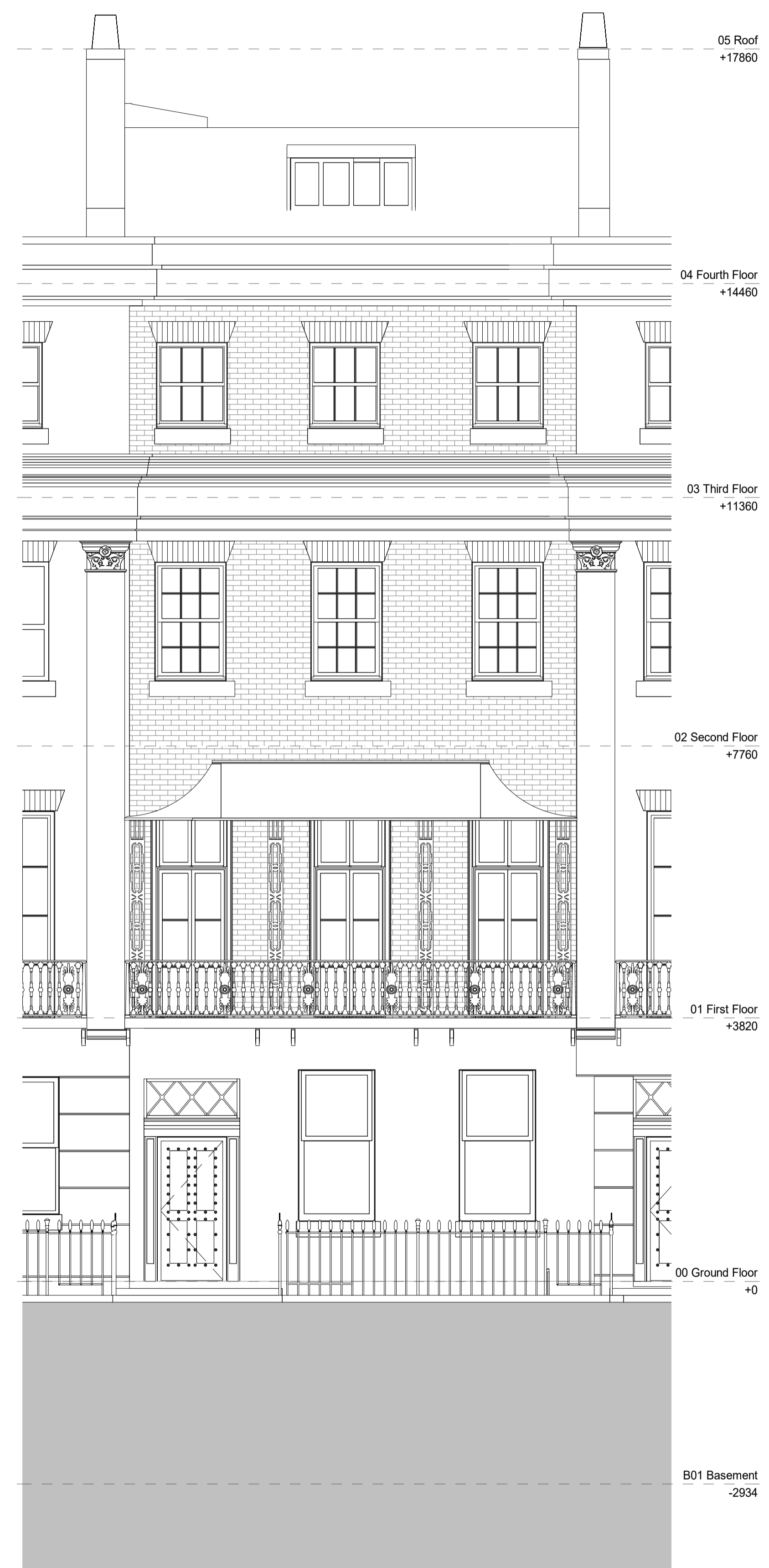
Front Elevation Scale 1 : 50