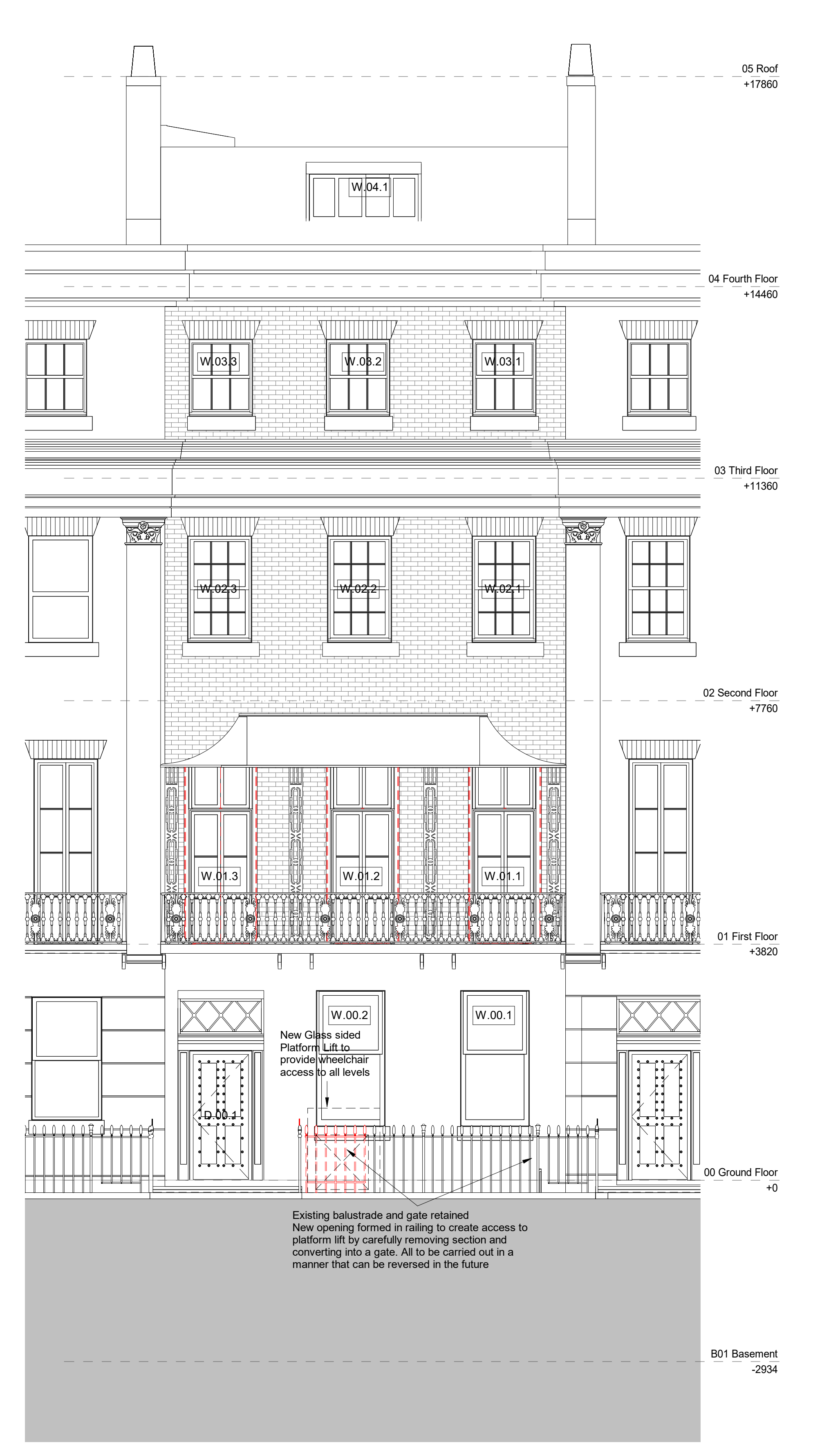
GA Proposed Front Elevation Demolition Scale 1:50

GA Proposed Rear Elevation Demolition Scale 1:50