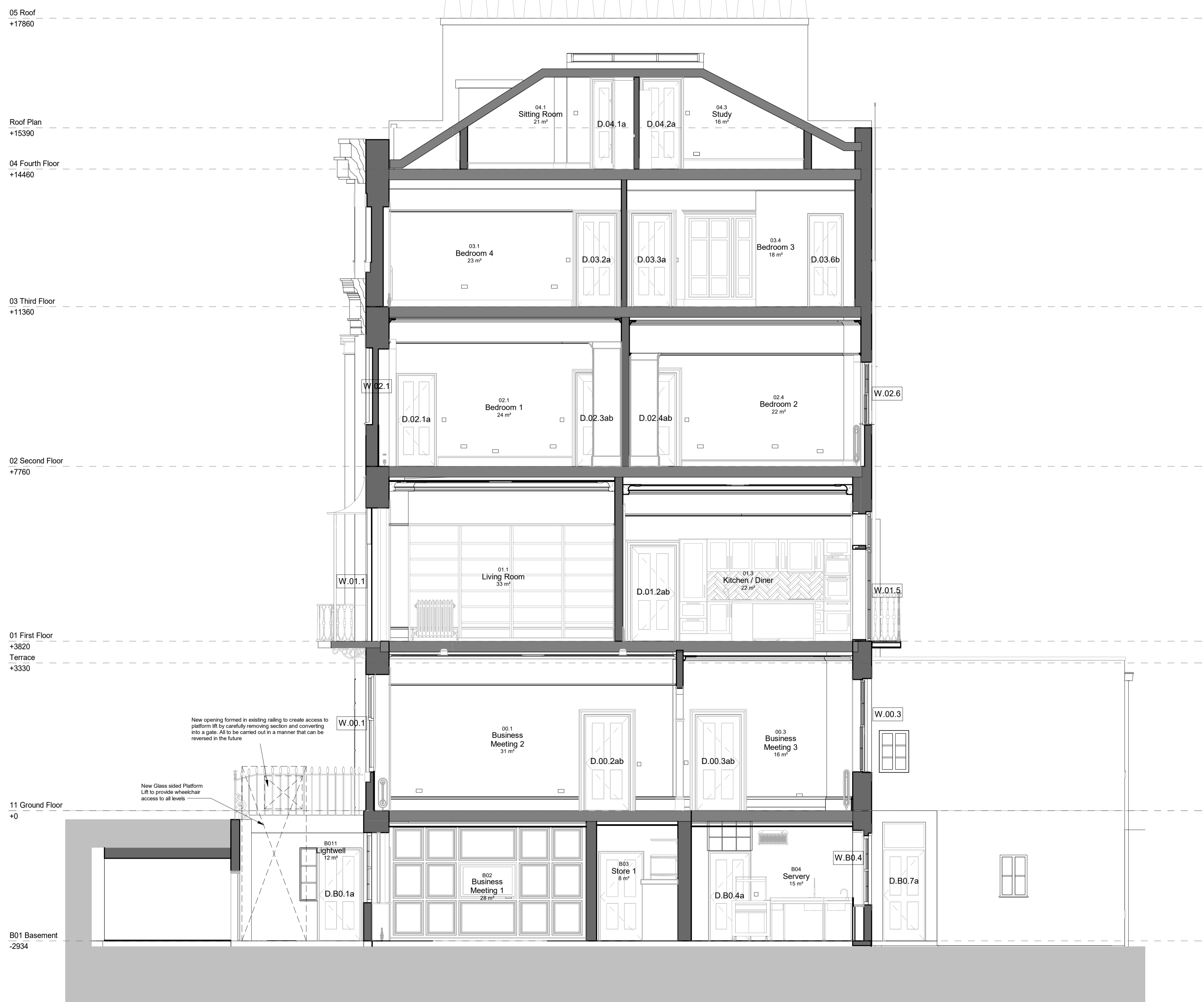
Section B Scale 1 : 50