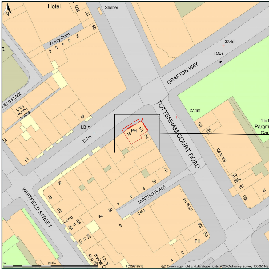
Site Plan Scale 1:1250