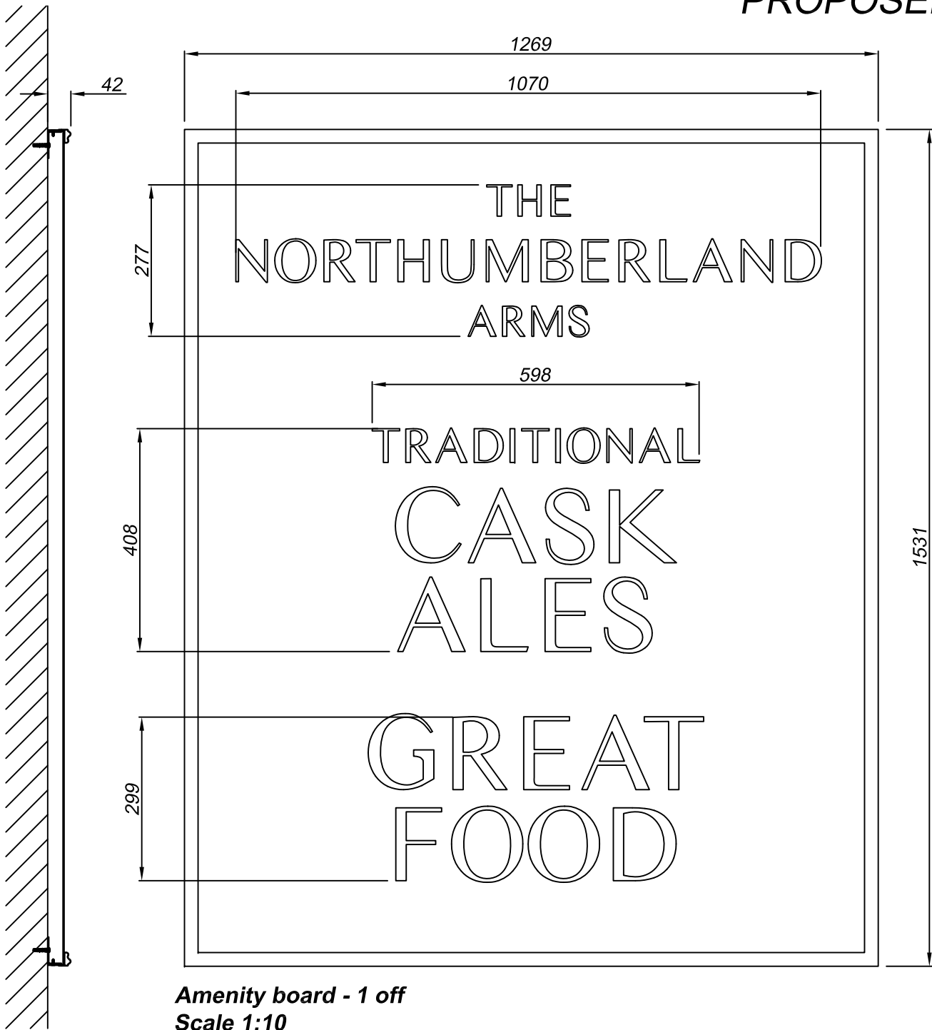
Amenity board - 1 off Scale 1:10

2mm ali face panels with frame and fixed via angle fixing brackets, finished F&B Railings. Text applied in cream vinyl.