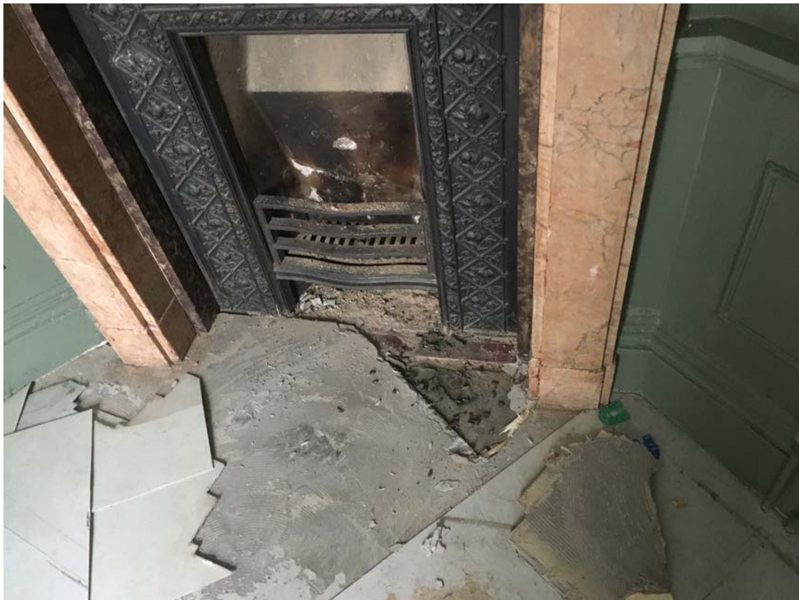
3 Photograph of existing (section of original hearth slab exposed)