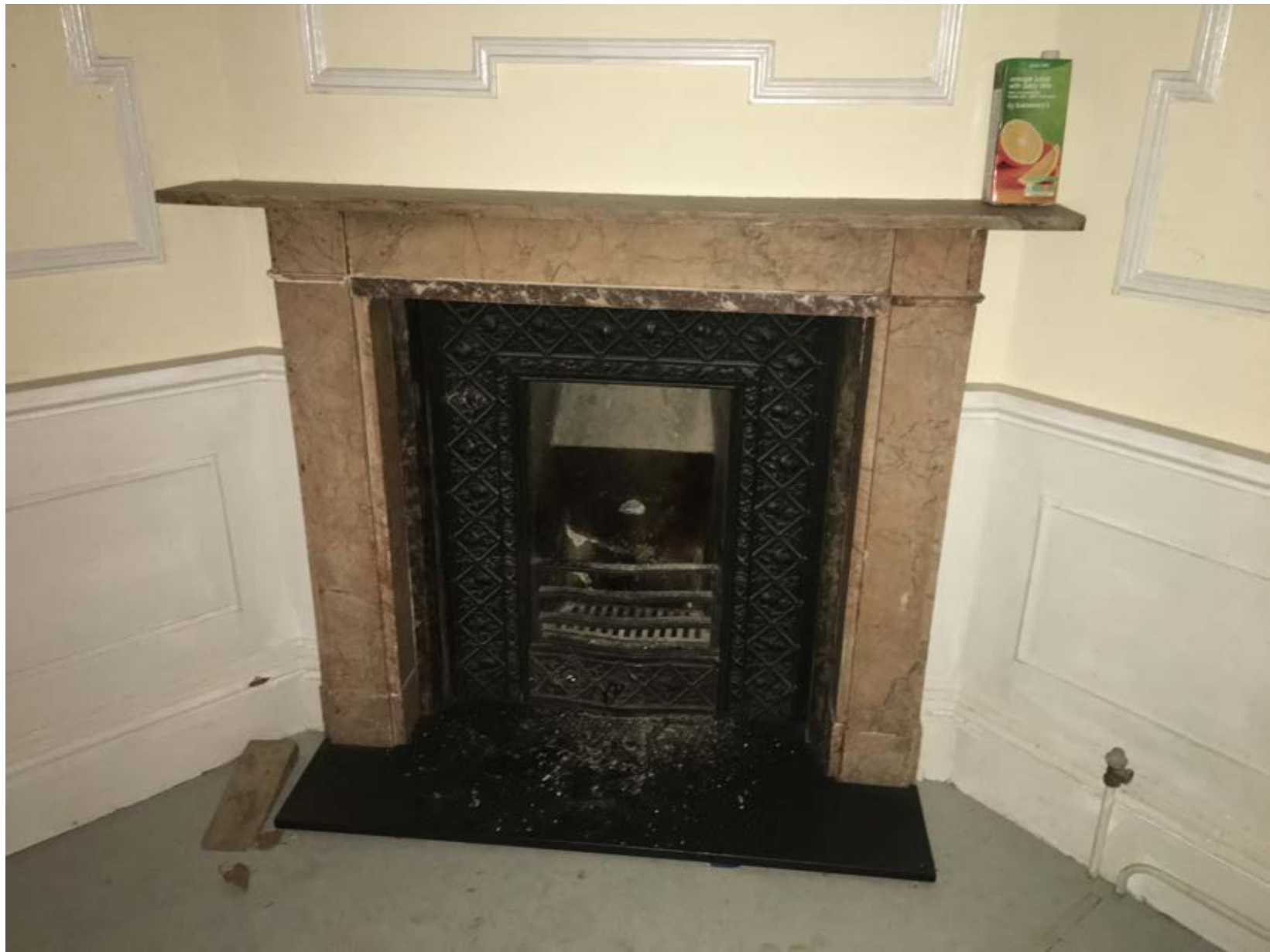
4 Photograph of existing (original hearth slab covered)