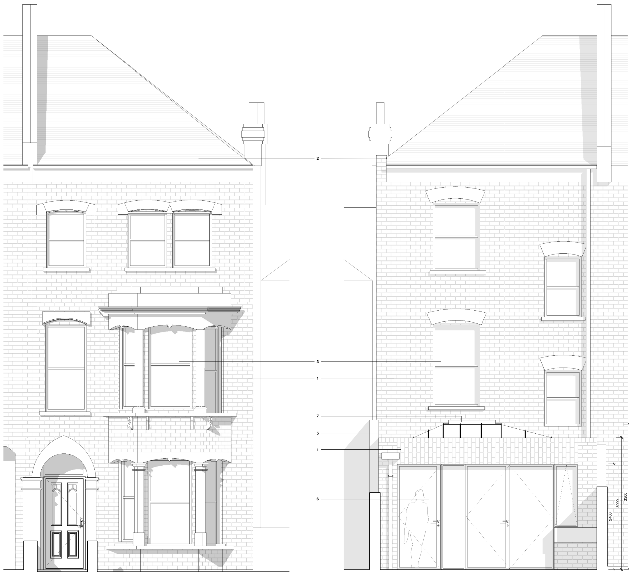
1 Proposed Front Elevation 1:50 @ A3

Check all dimensions and site conditions prior to commencement of any work, the purchase or ordering of any materials, fittings, plant, services or equipment and the preparation of shop drawings and or the fabrication of any components. Do not scale drawings - refer to figured dimensions only. Any discrepancies shall immediately be referred to PD Architecture+Interiors for clarification. All drawings may not be reproduced or distributed without prior permission from PD Architecture+Interiors.