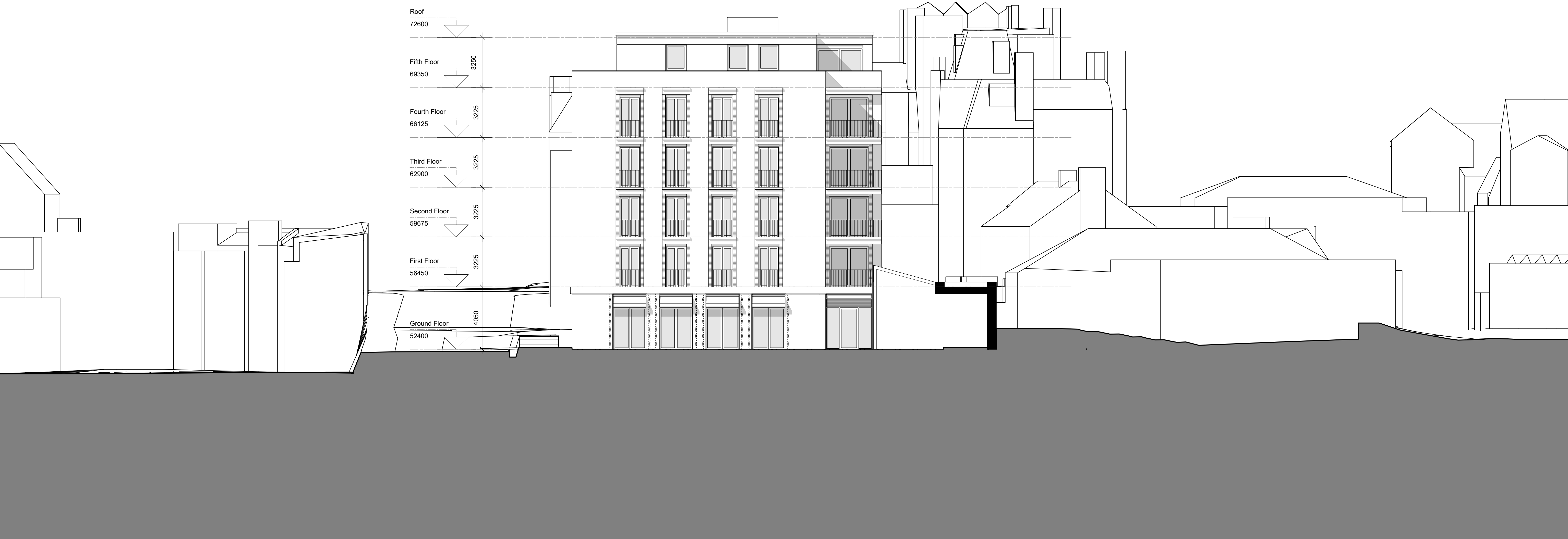
1 COURTYARD ELEVATION EAST - PROPOSED Scale: 1:125