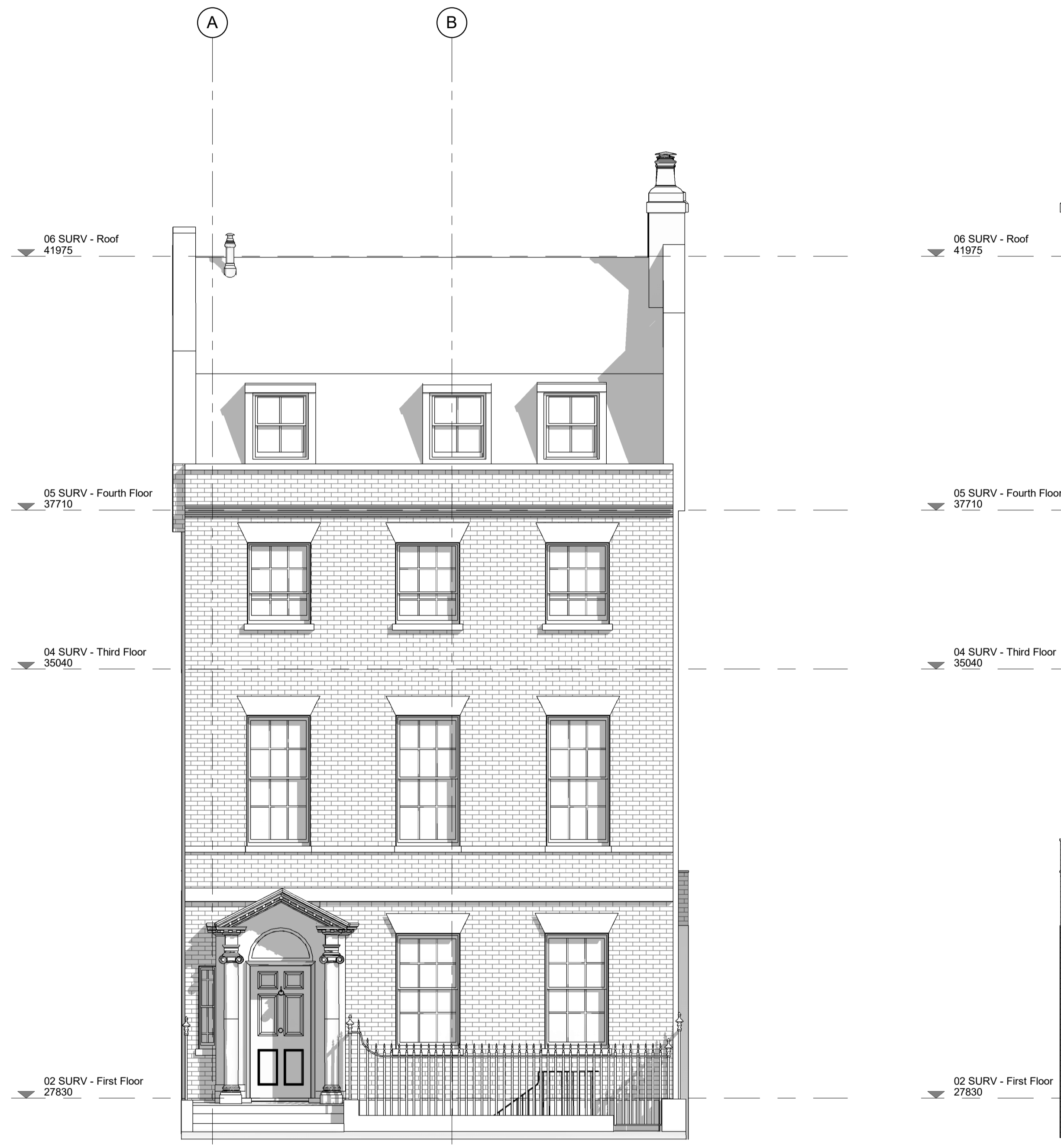
Proposed Front Elevation 1 : 50