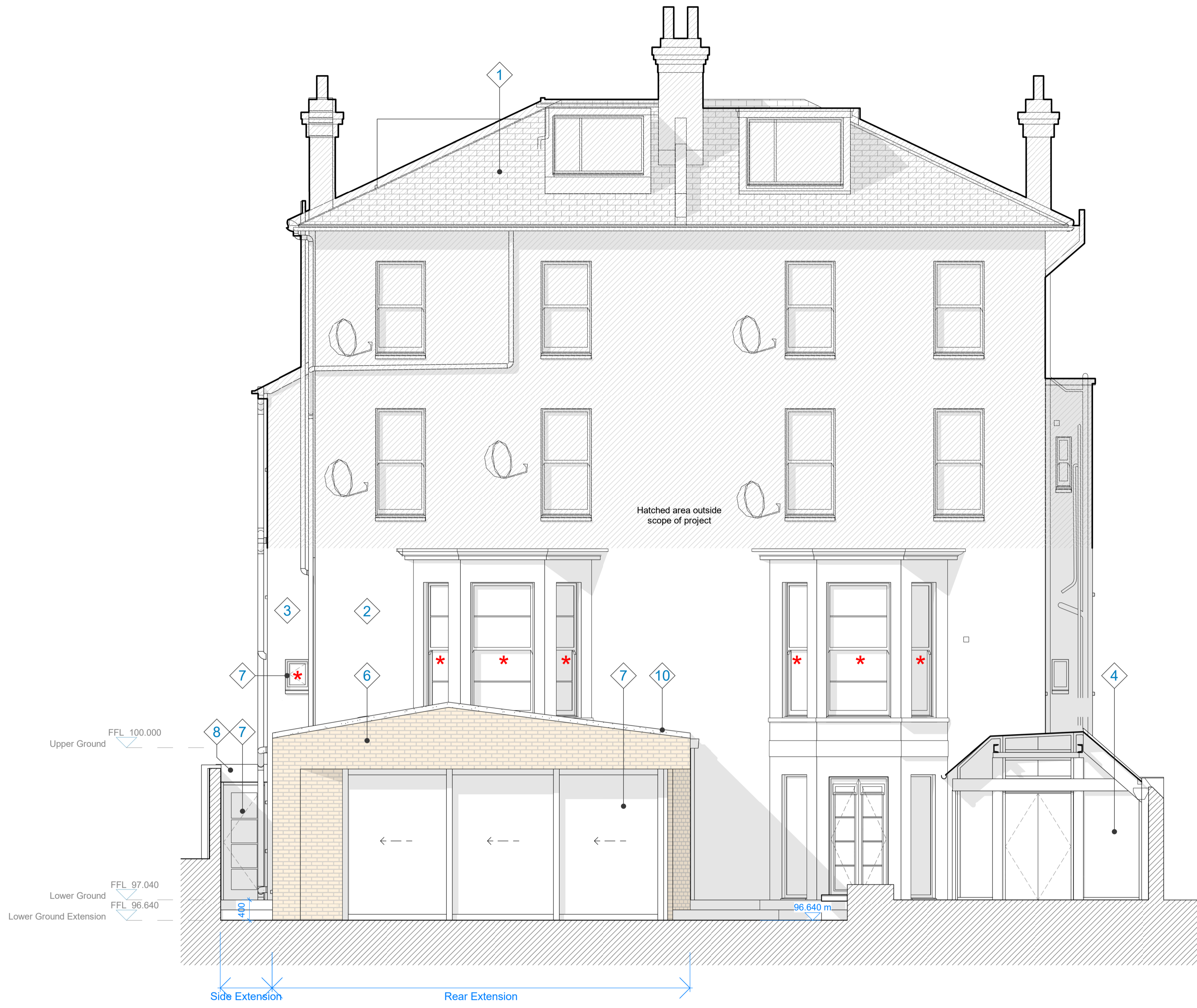
1 Proposed South Elevation 1 : 50