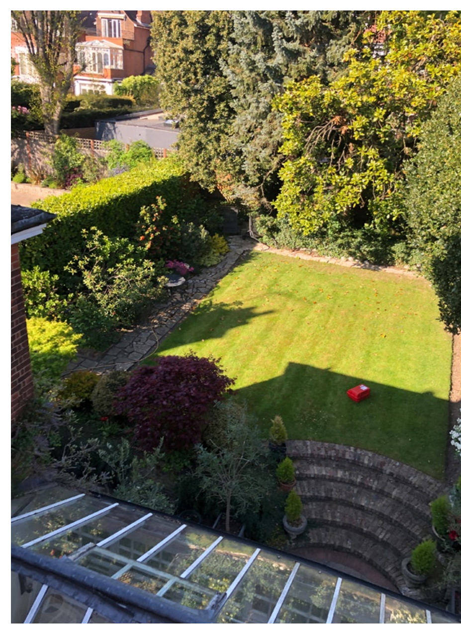
01 - View from the building to the rear garden - boundary to no.22