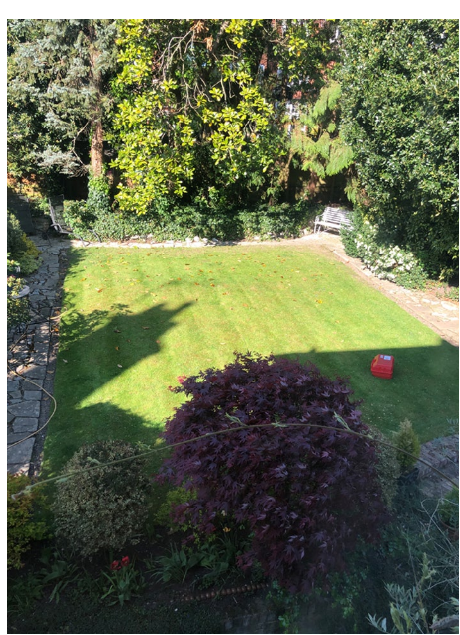
02 - View from the building to the rear garden