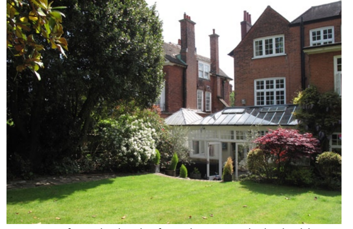
08 - View from the back of garden towards the building, towards no.26 side