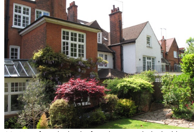
09 - View from the back of garden towards the building, towards no.22 side