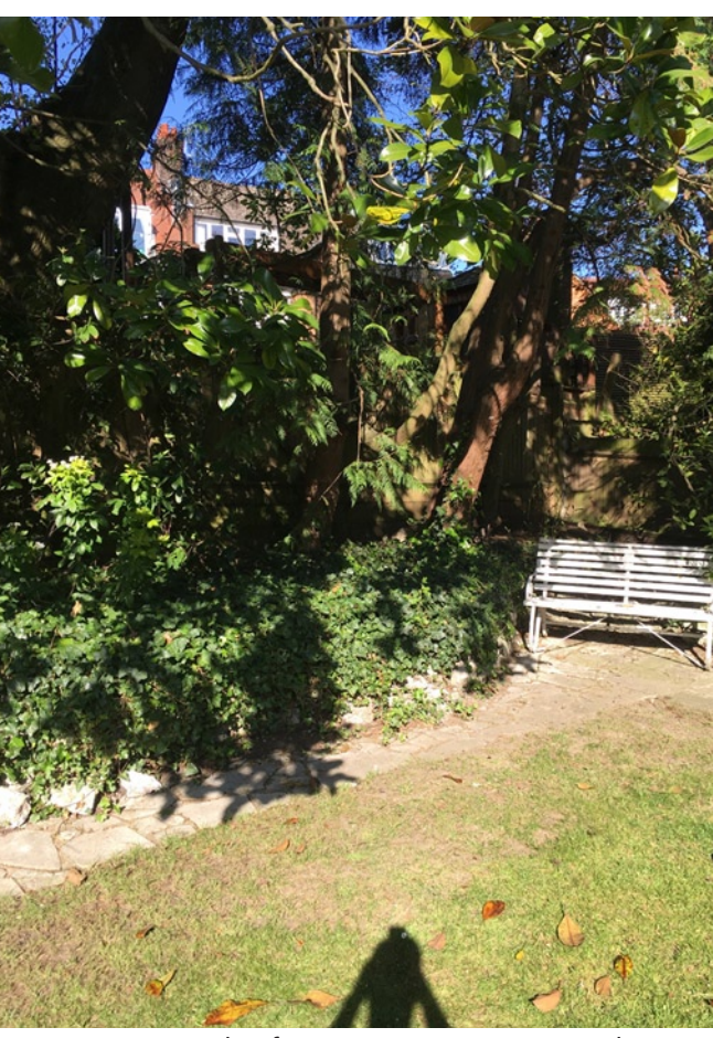
05 - Existing wooden fence - corner to no.26 and rear