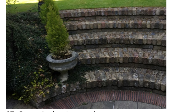
07 - Existing brickwork steps to lawn