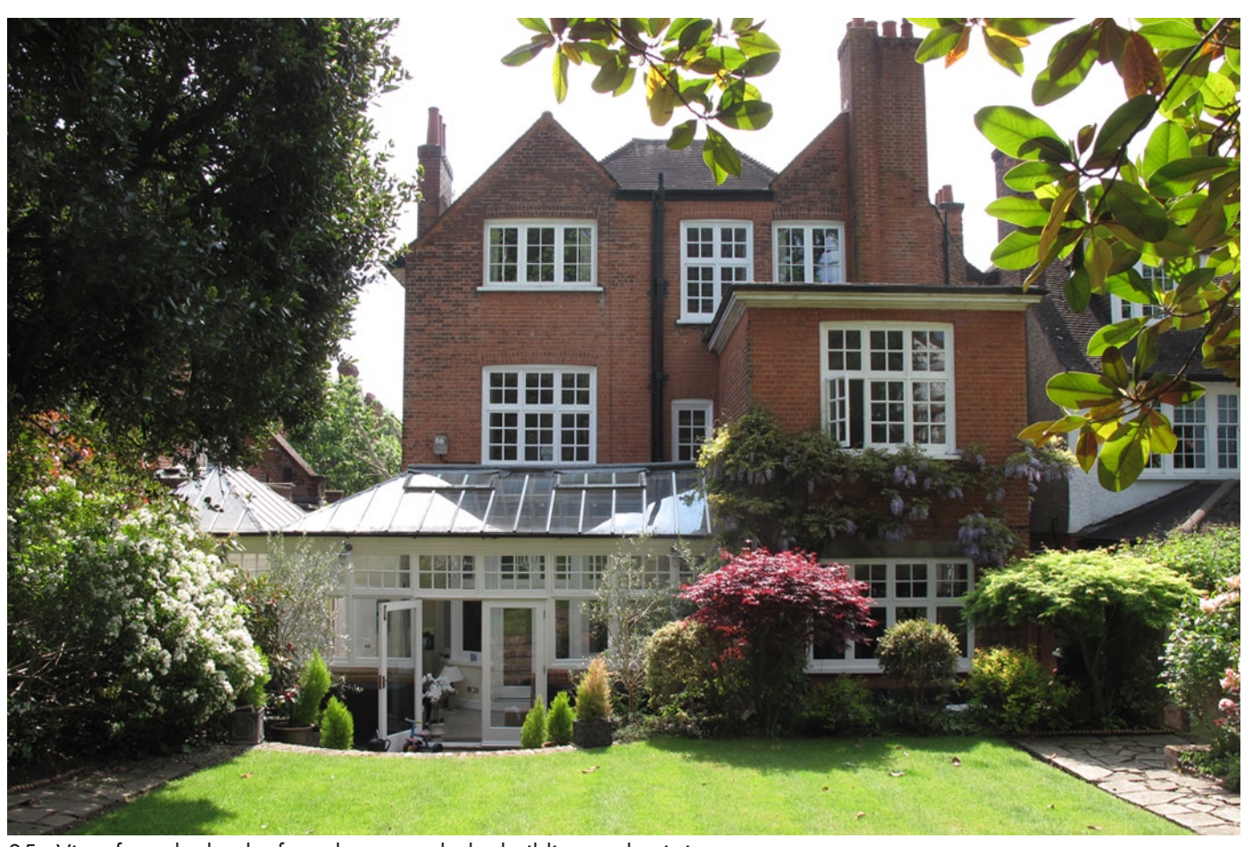
05 - View from the back of garden towards the building and existing steps