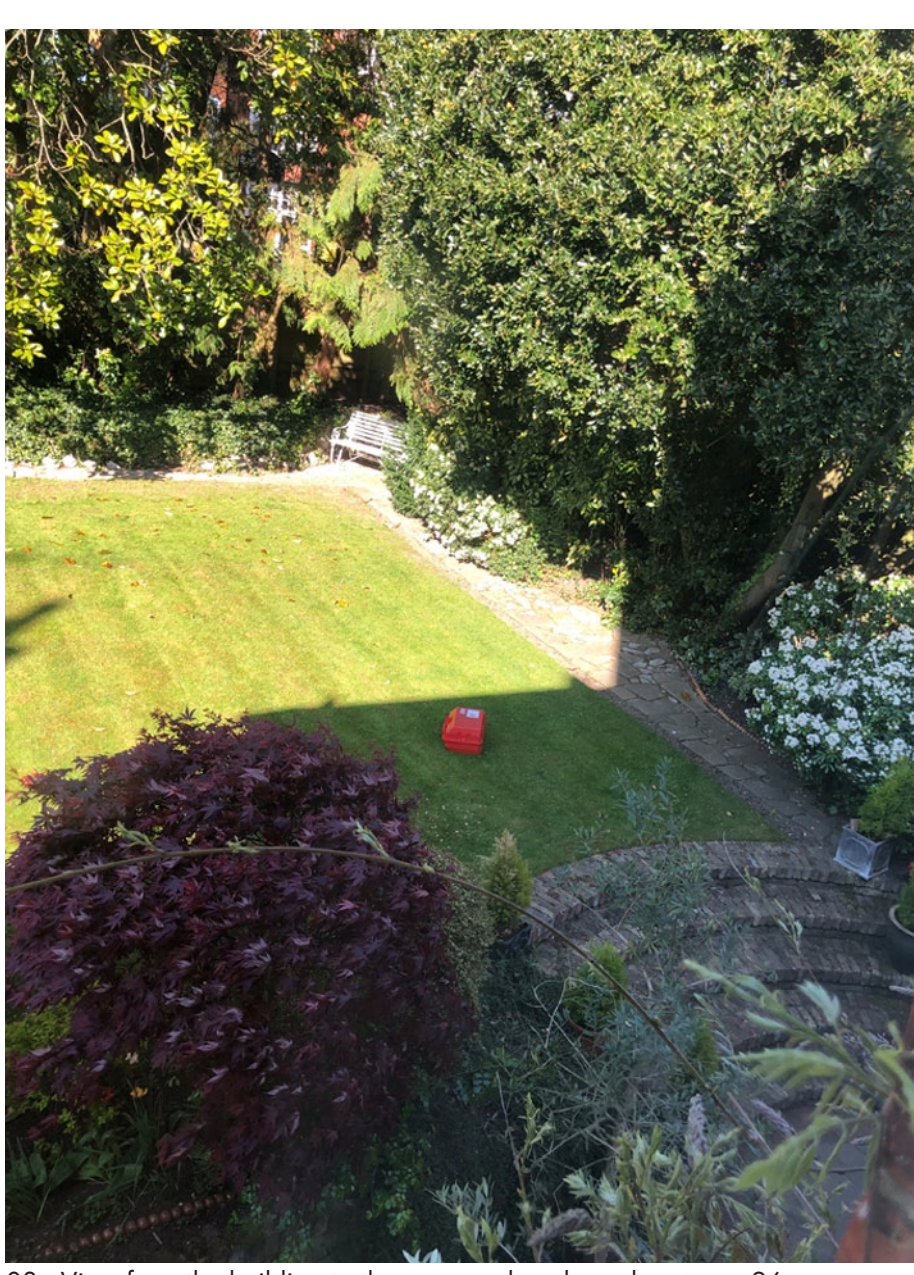
03 - View from the building to the rear garden - boundary to no.26