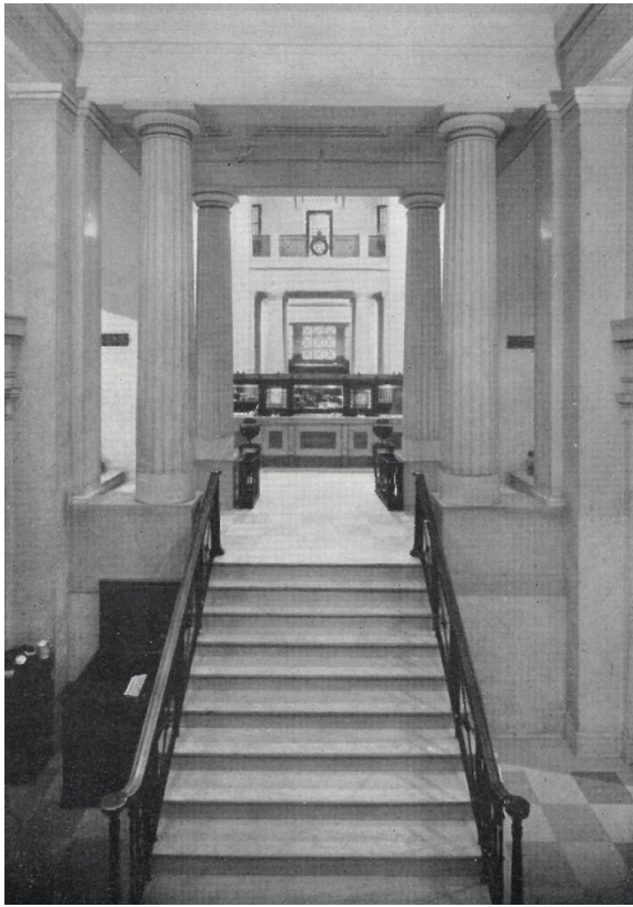
Access to Central Hall

IMAGES from Liverpool Victoria Friendly Society Centenary Celebration 1843-1943