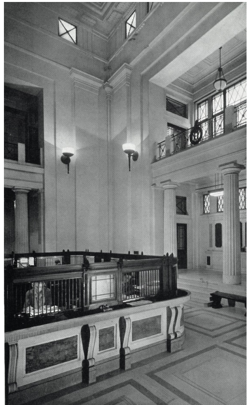
Central Hall Public Office