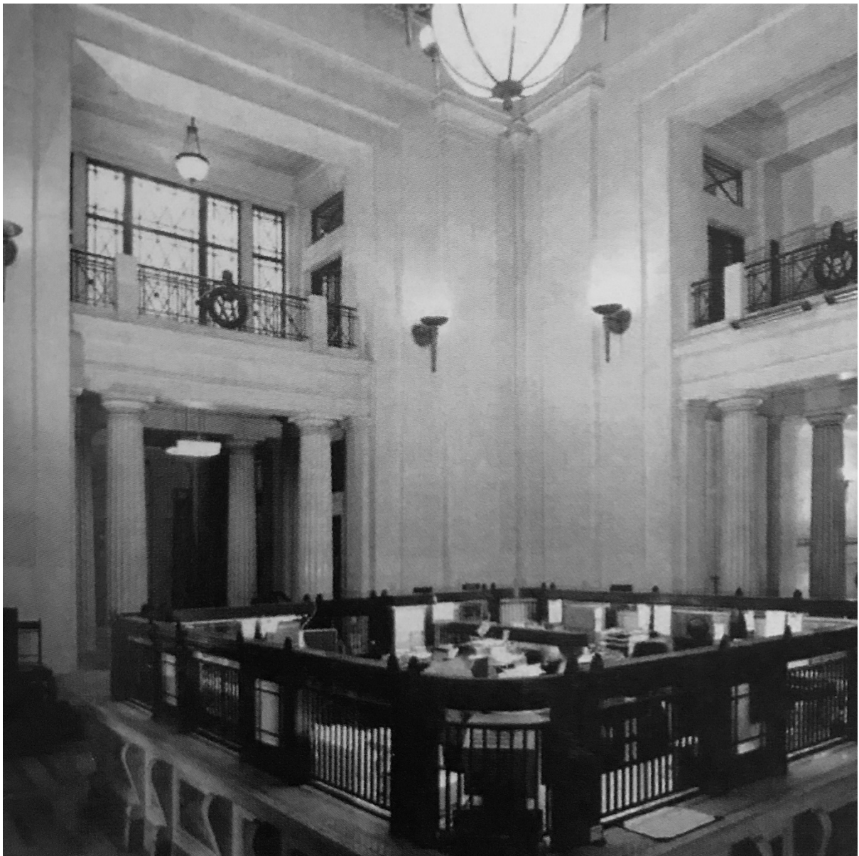
Victoria House Public Hall 1943