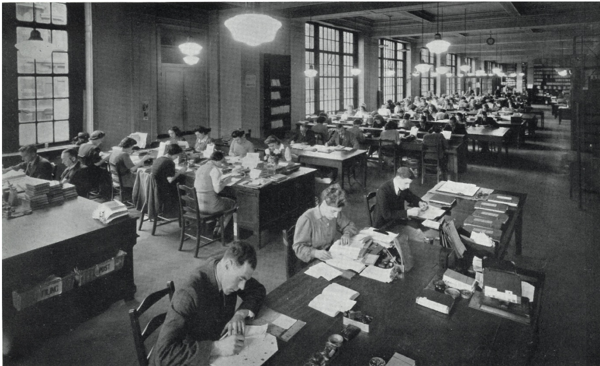
One of the Head Office Departments