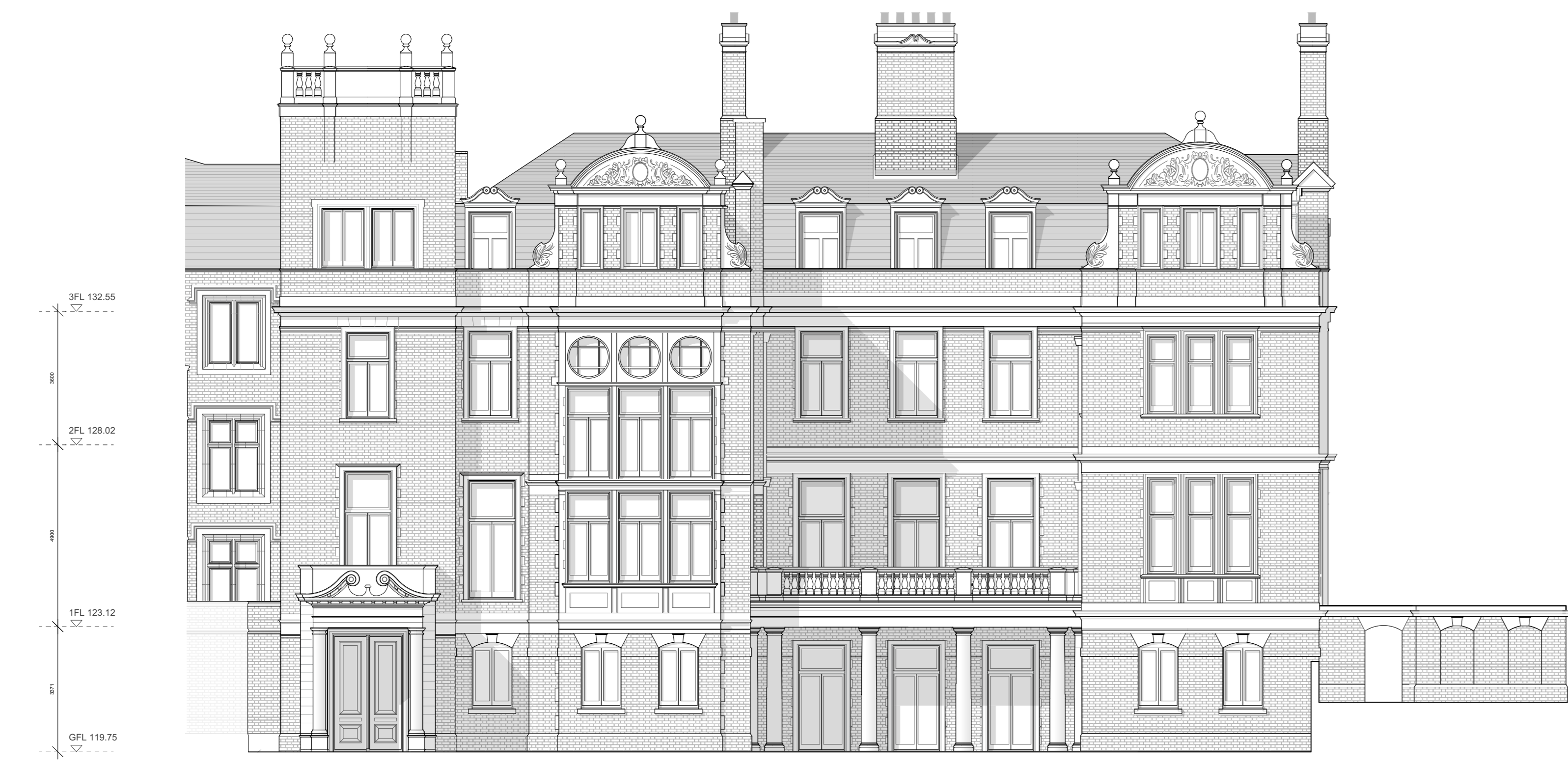
3 PROPOSED EAST ELEVATION Scale: 1:100