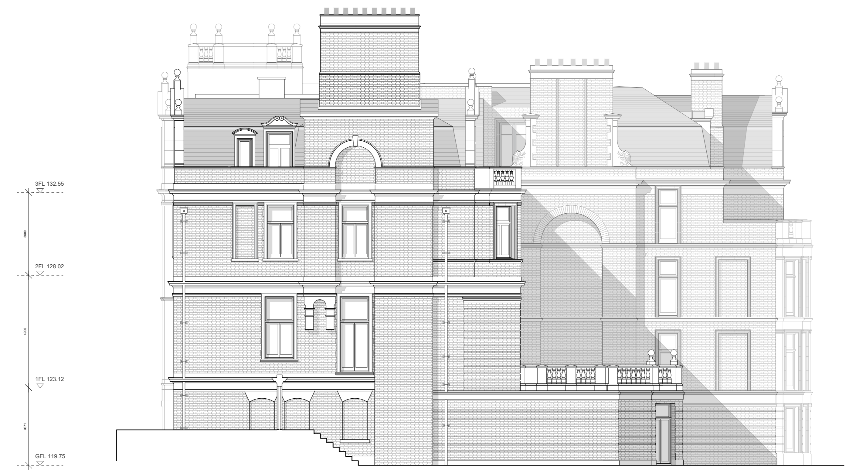
7 PROPOSED NORTH - WEST ELEVATION Scale: 1:100