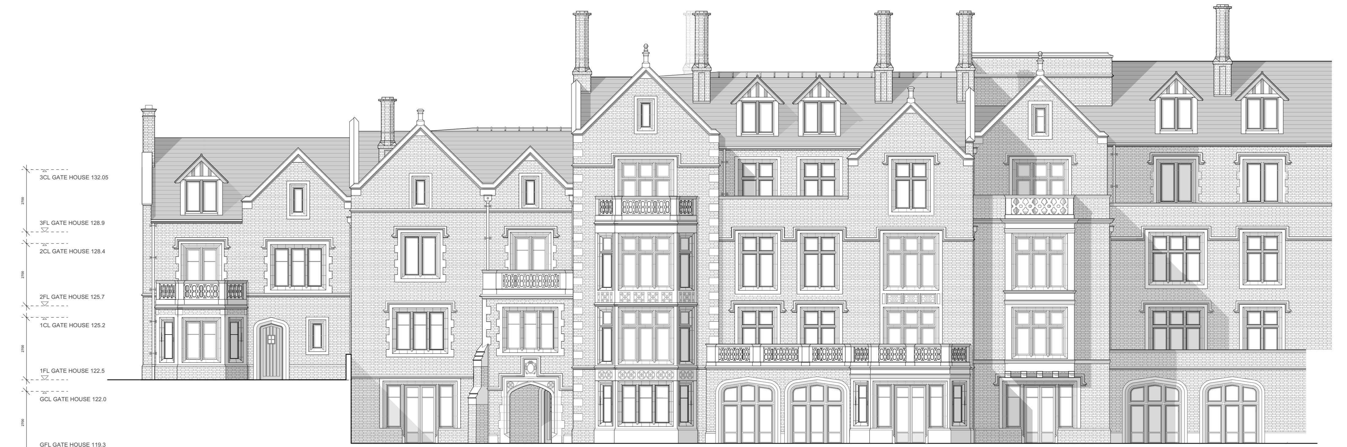
5 PROPOSED NORTH ELEVATION Scale: 1:100