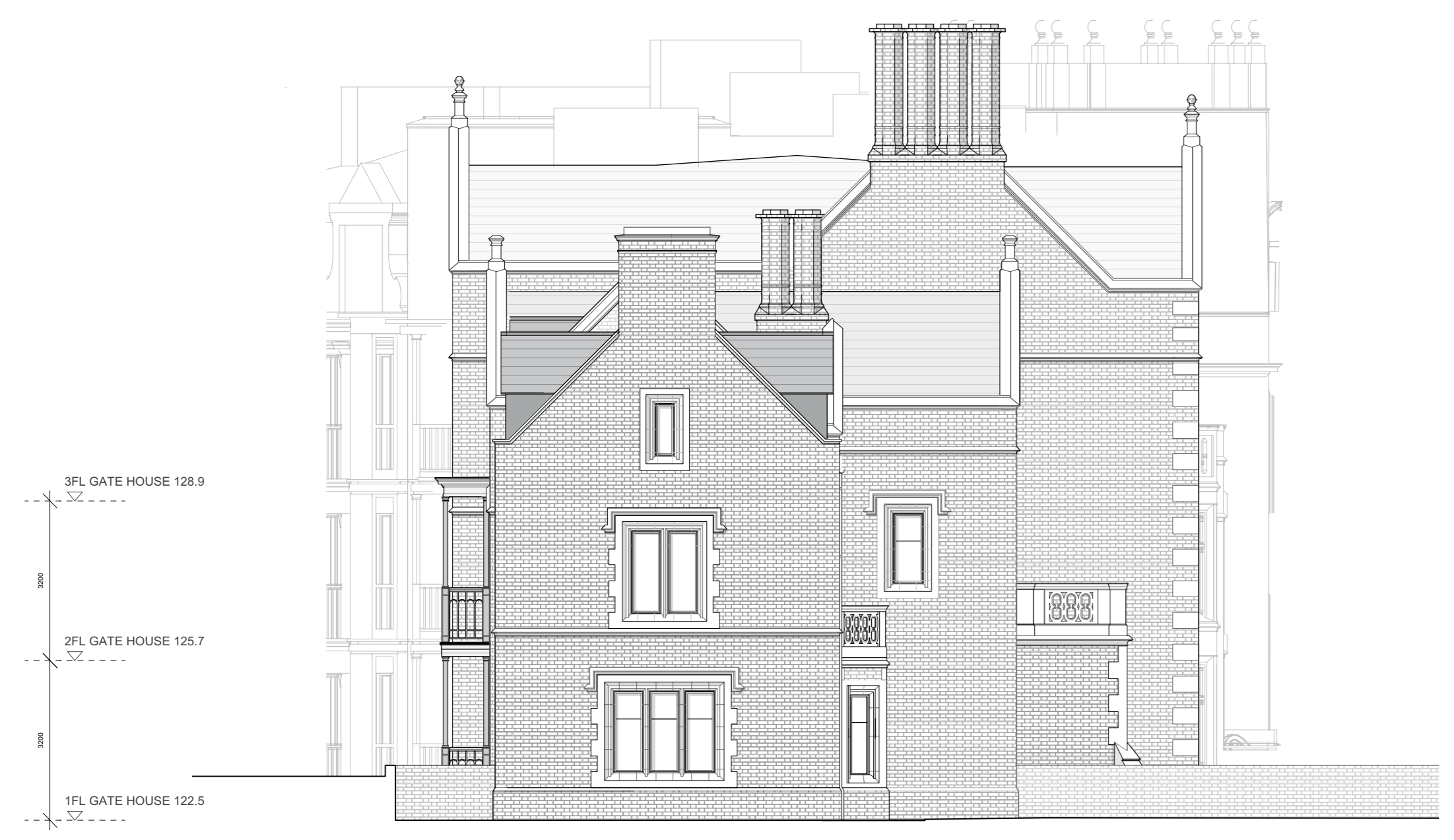
6 PROPOSED EAST ELEVATION - GATE HOUSE Scale: 1:100