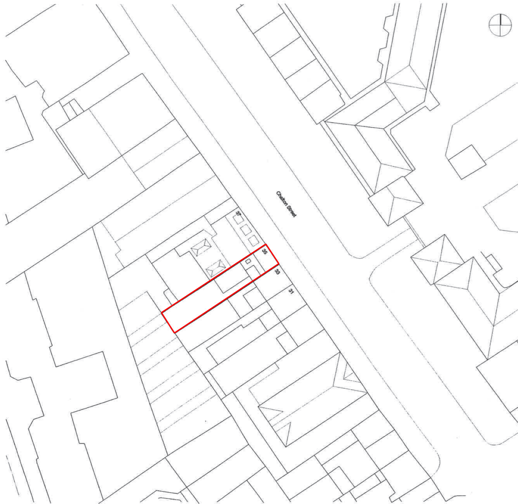
SITE PLAN @ 1:500