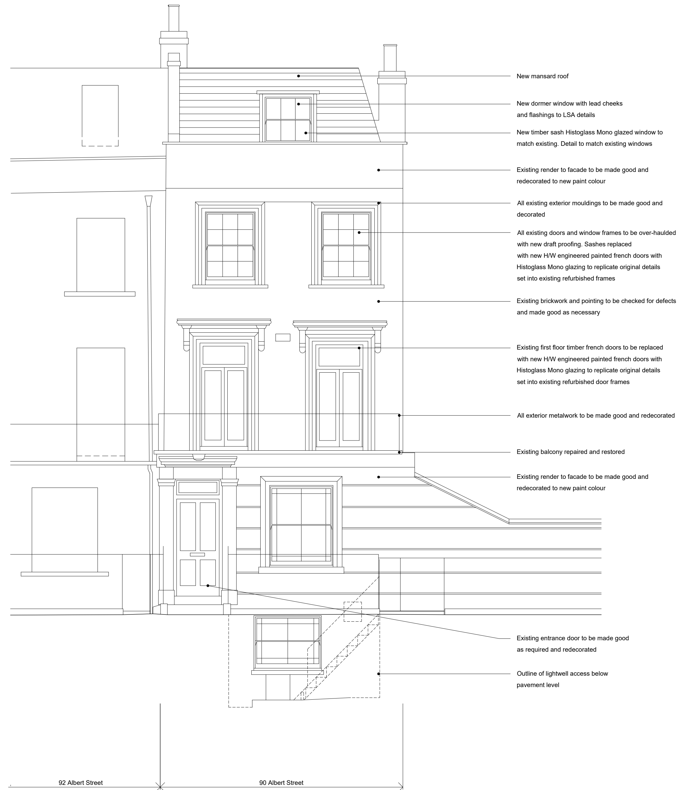
1. Street Elevation