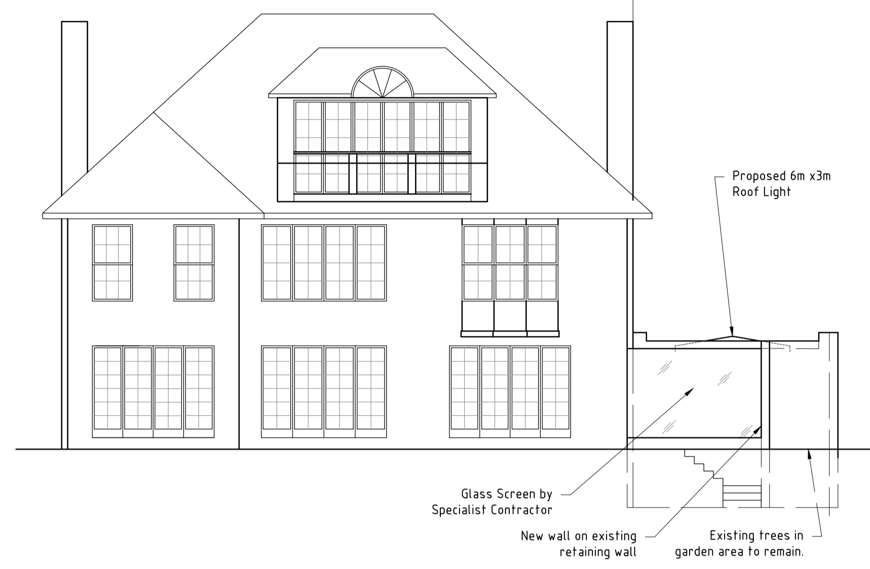
REAR ELEVATION AS PROPOSED SCALE 1:100@A1