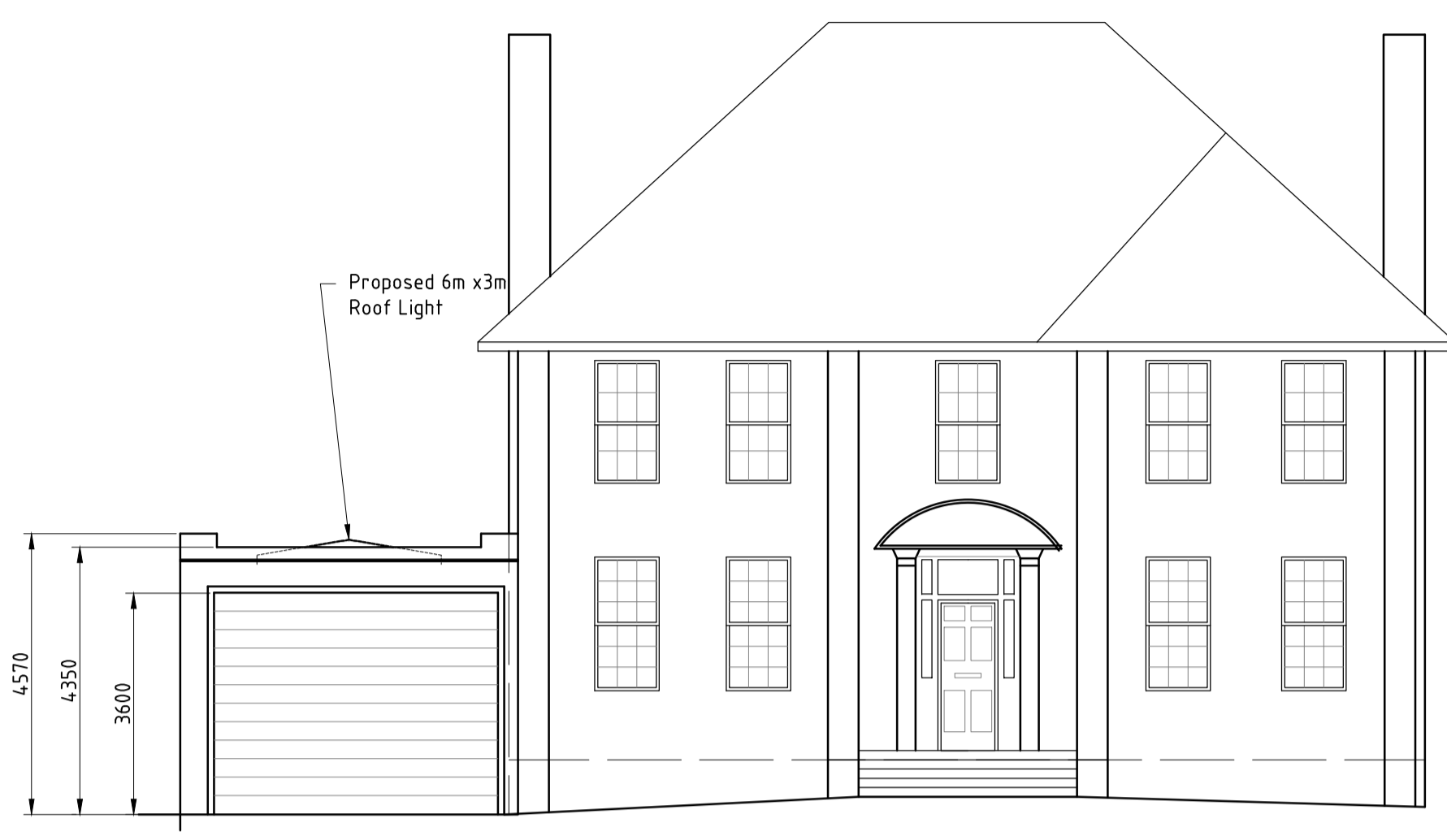
FRONT ELEVATION AS PROPOSED SCALE 1:100@A1

GENERAL Copyright . No part of this drawing or any other drawings, details, calculations or schedules pertaining to this project as titled (including any notes therein) may be reproduced in any form either in part or whole without the prior permission in writing of Derek LOFTY & Associates. All dimensions are in millimeters. Unless noted otherwise. Do not scale this drawing - other than for planning purposes. If in doubt - ASK! This drawing is not to be used for setting out. All sizes and dimensions to be checked on site prior to commencement and confirmed by the Architect. This drawing is to be read in conjunction with all other relevant drawings and details. Materials and workmanship must be of a standard conforming with the appropriate recognised authority. For example "National House Building Council", "British Standards Institution", "Department of the Environment - (Building Regulations 1991)" etc. HEALTH & SAFETY The Contractor must at all times operate safe working practices, maintain the integrity of the existing structures, and conform to all the appropriate requirements of the Health & Safety Executive including the current "Construction (Health, Safety and Welfare) Regulations". The working methods of any hazardous operations must first be discussed with the designer and or project manager prior to commencement