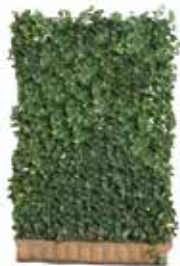
Top image: screen with foliage when delivered. Bottom image: screen with foliage after one growing season.