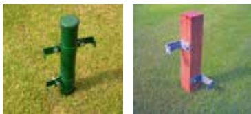
Left steel post and right wooden post