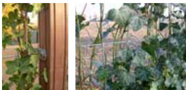
Detail bracket and weldmesh with Ivy