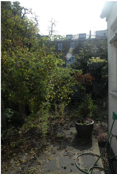
5. SUMMER VIEW LOOKING DOWN THE GARDEN TOWARDS BELSIZE GROVE.