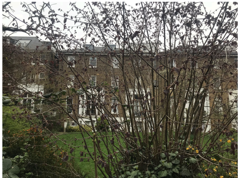
4. WINTER VIEW THROUGH THE BOUNDARY HEDGE TOWARDS BELSIZE GROVE.