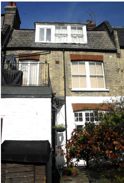
2. IMAGE OF THE REAR TO N°53 HOWITT ROAD