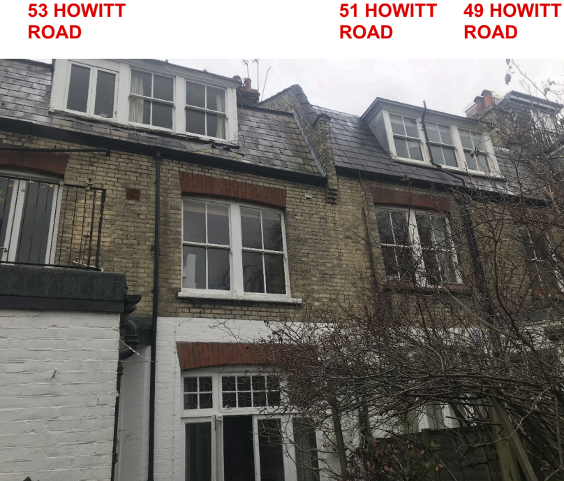
3. VIEW ACROSS THE REAR OF ADJOINING PROPERTIES LOOKING TOWARDS 49 HOWITT ROAD.