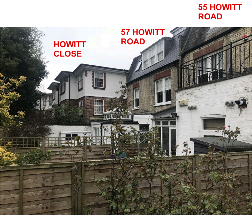
1.VIEW ACROSS THE REAR OF ADJOINING PROPERTIES LOOKING TOWARDS HOWITT CLOSE.