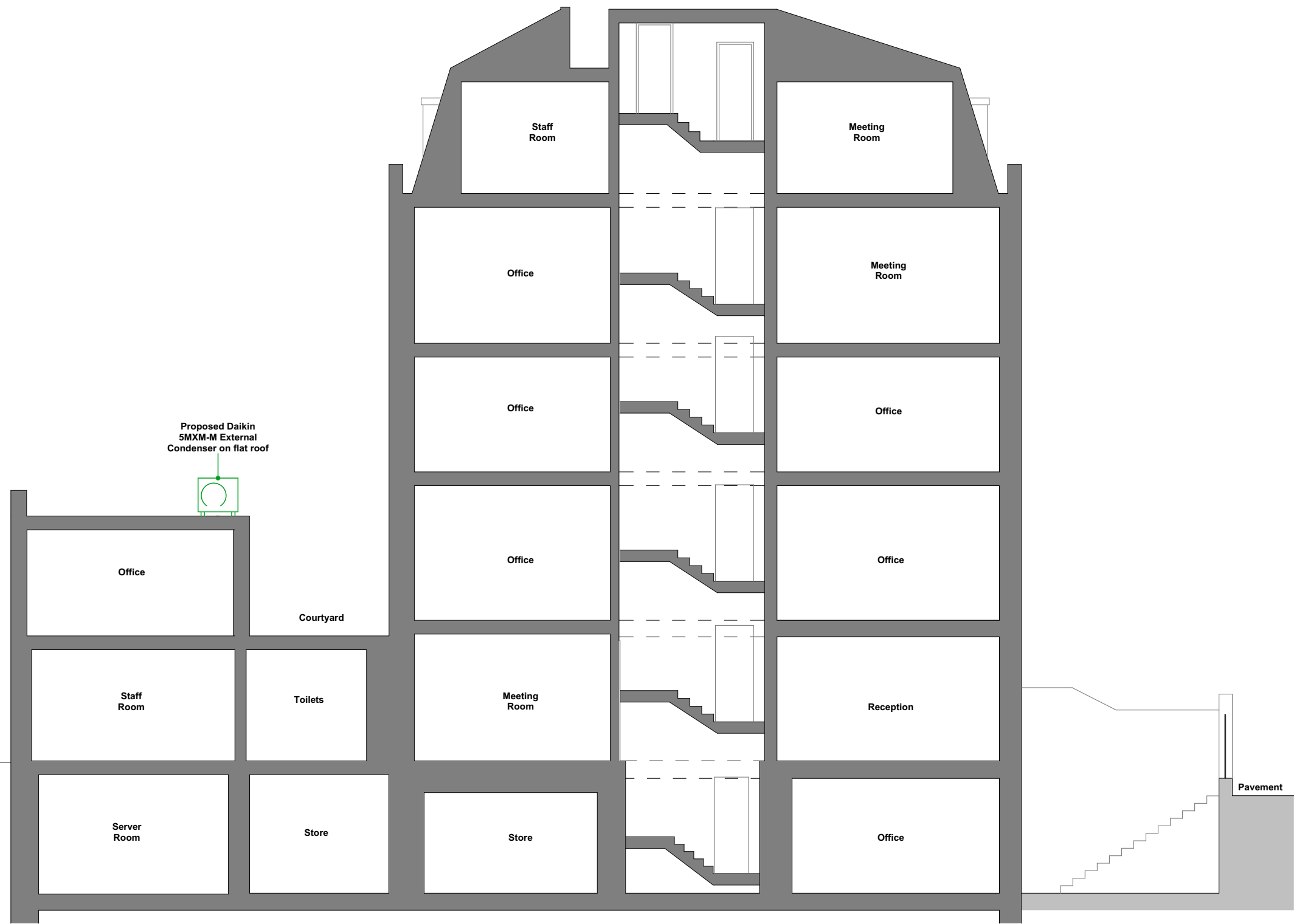
Section - S01

www.lambertsurv.co.uk This drawing is the copyright of Lamberts and may not be reproduced without written consent. Do not scale this drawing. All dimensions to be checked on site before work commences.