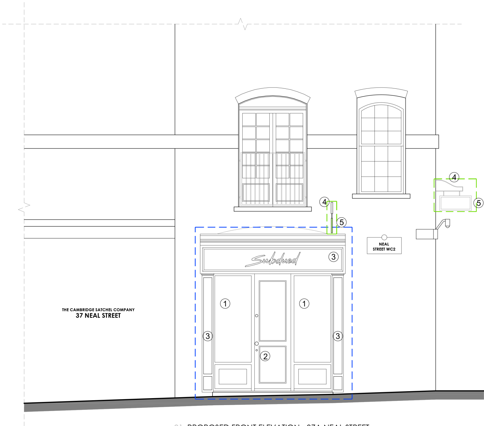
01 PROPOSED FRONT ELEVATION - 37A NEAL STREET 1:50

This drawing is copyright and may not be reproduced in whole or part without written authority. Bishop & Associates does not accept liability for any deviation to our drawings or specification. All measurement subject to full measured survey.