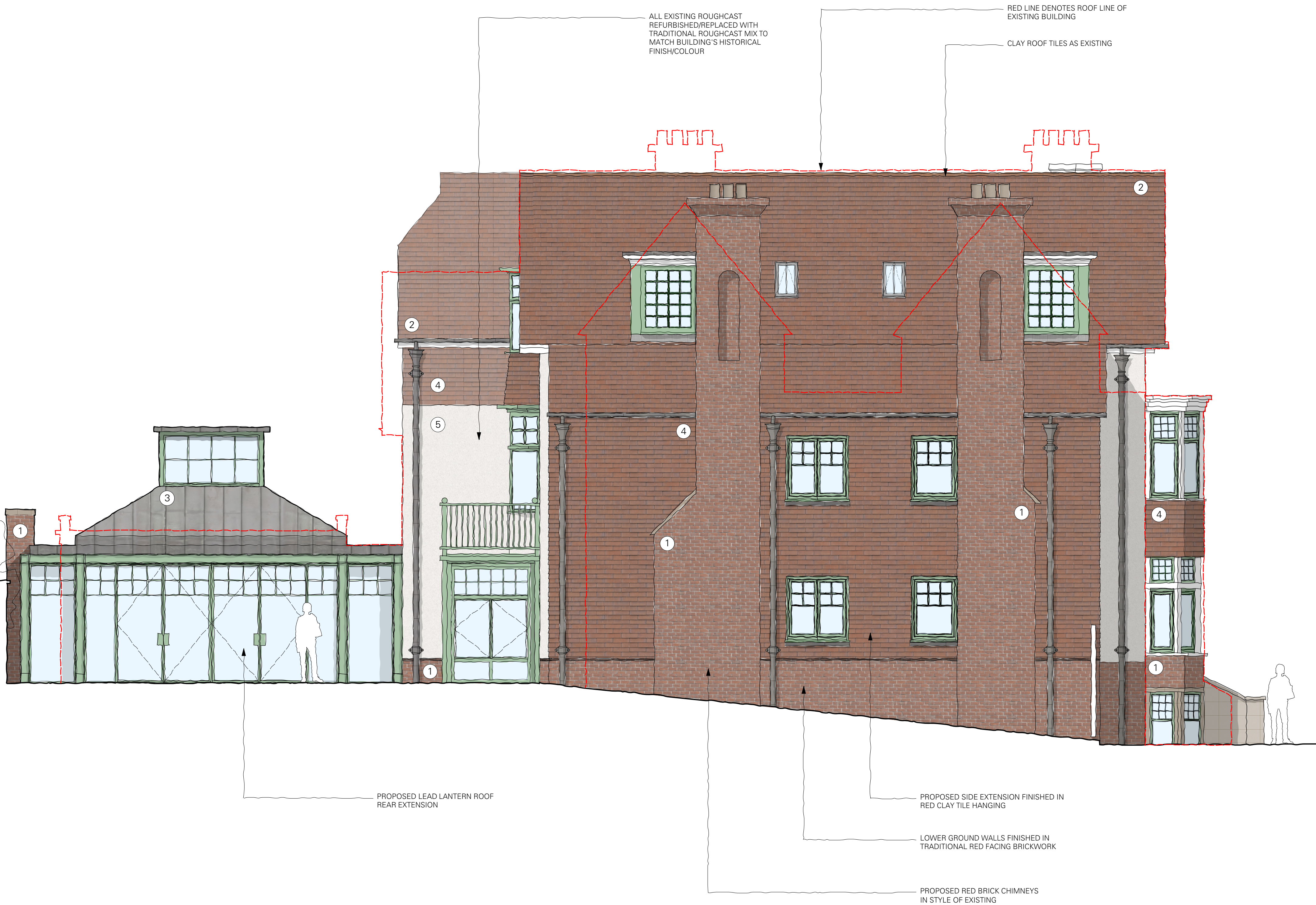
2 NORTH-WEST ELEVATION Scale: 1:50