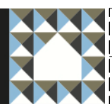
2 18 PROPOSED SECTION Scale 1:20