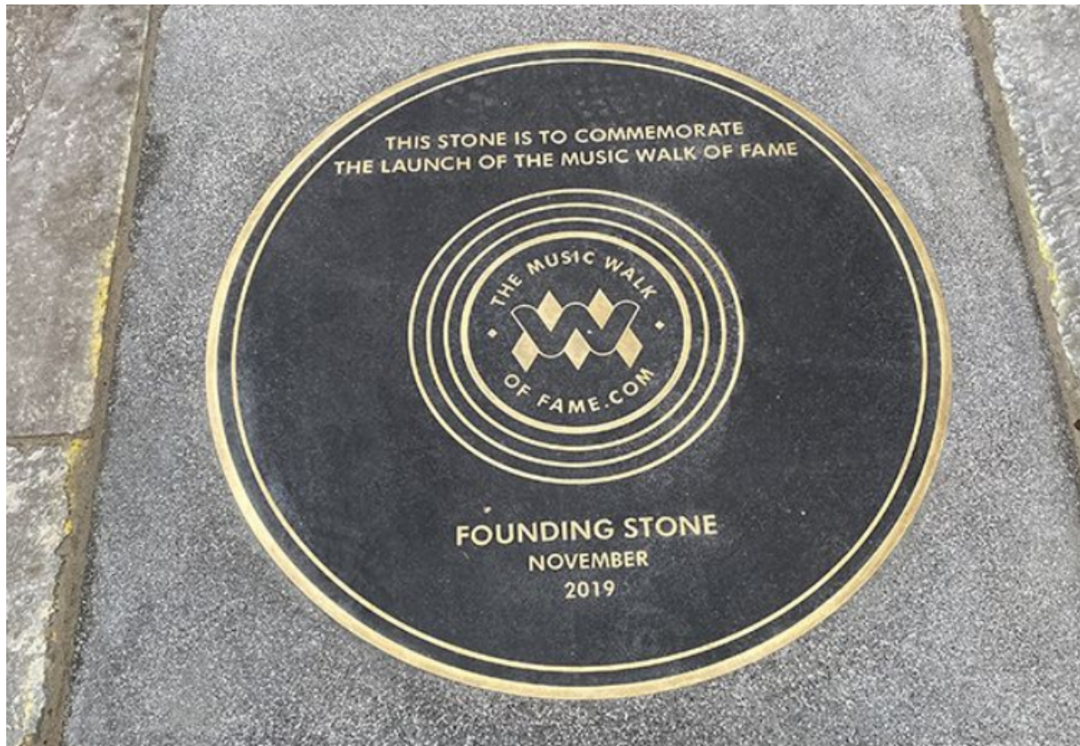
2) Existing stone installed on Camden High Street