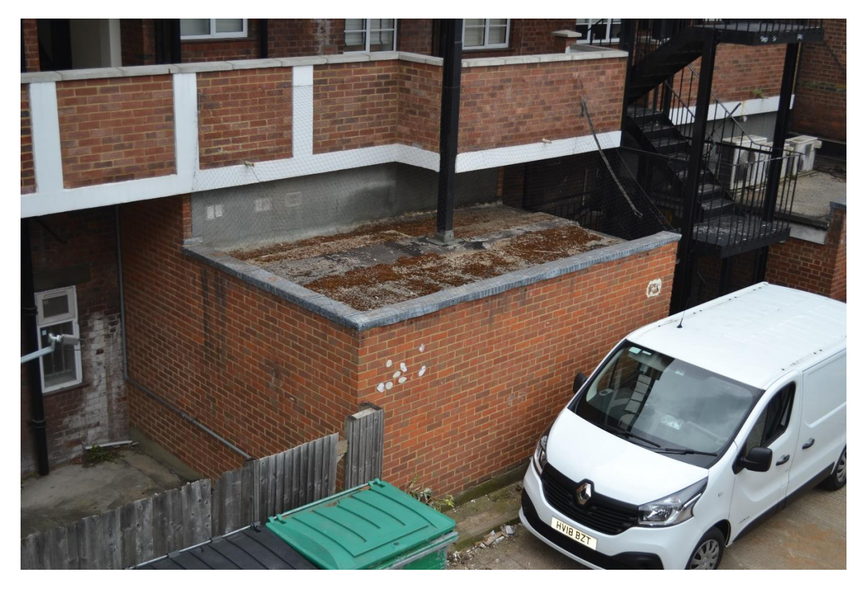
Adjoining Extension to No 193 Haverstock Hill