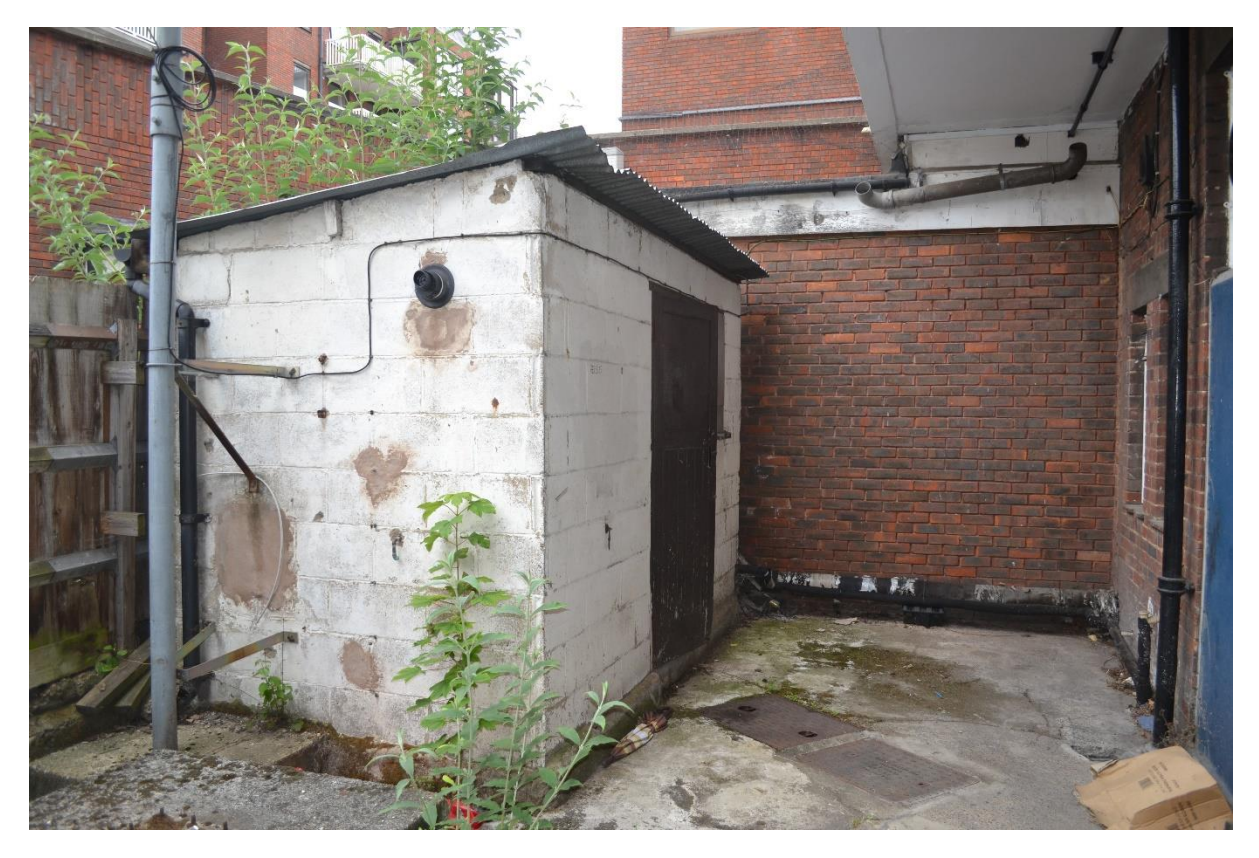
Rear Yard to be Developed #1