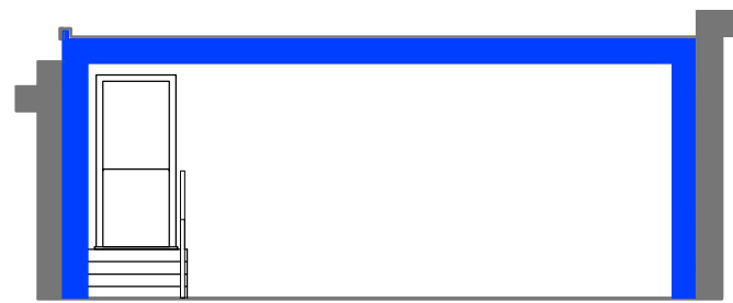
Proposed Section BB' Scale 1:100