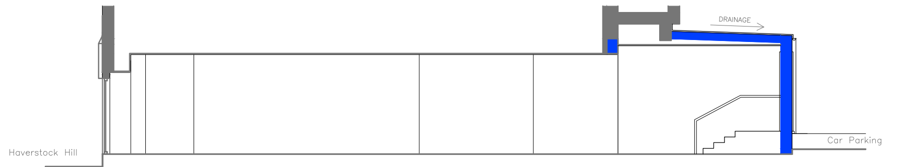
Proposed Section AA' Scale 1:100